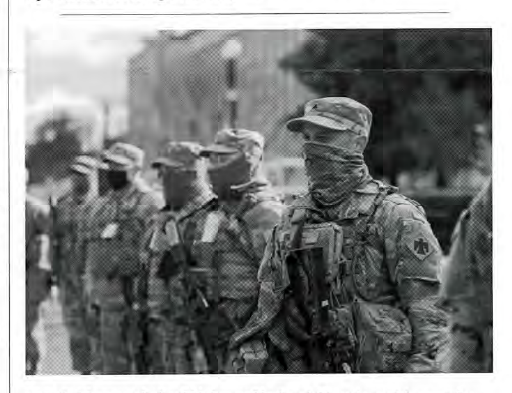
U.S. Soldiers with the Oklahoma National Guard provide security around the U.S. Capitol building, Washington, D.C., Jan. 20, 2021. At least 25,000 National Guard men and women have been authorized to conduct security, communication and logistical missions in support of federal and District authorities leading up and through the 59th Presidential Inauguration.

One thing that has remained constant during the history of the 45th is the distinctive thunderbird patch. The patch dons the sleeves of not just the men and women of the 45th Infantry Brigade Combat Team though. It is worn by the 90th Troop Command, appears on the patch of the 45th Field Artillery Brigade and is seen in Oklahoma Air National Guard symbols as well, making Oklahoma one of the most readily recognizable states among National Guard units serving at the nation's Capitol.