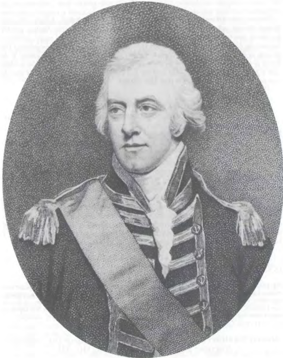
Admiral Sir John Borlase Warren, R.N.