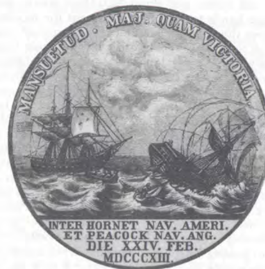
Medal Commissioned by Congress Commemorating the Victory of U.S. Sloop of War Hornet over H.M. Brig Sloop Peacock