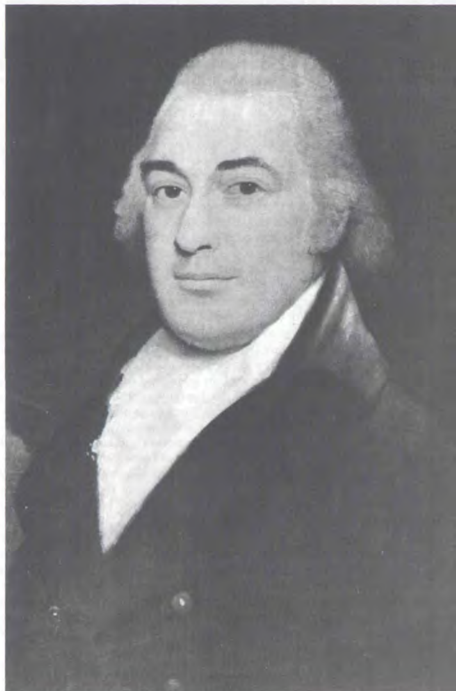
Secretary of the Navy William Jones

Permit me to revive the Suggestions I had the honor to make to you in conversation relative to the better organization of the Navy Department, and though it would be premature in me to offer any general system of improvement yet in my view there are some prominent defects in the establishment