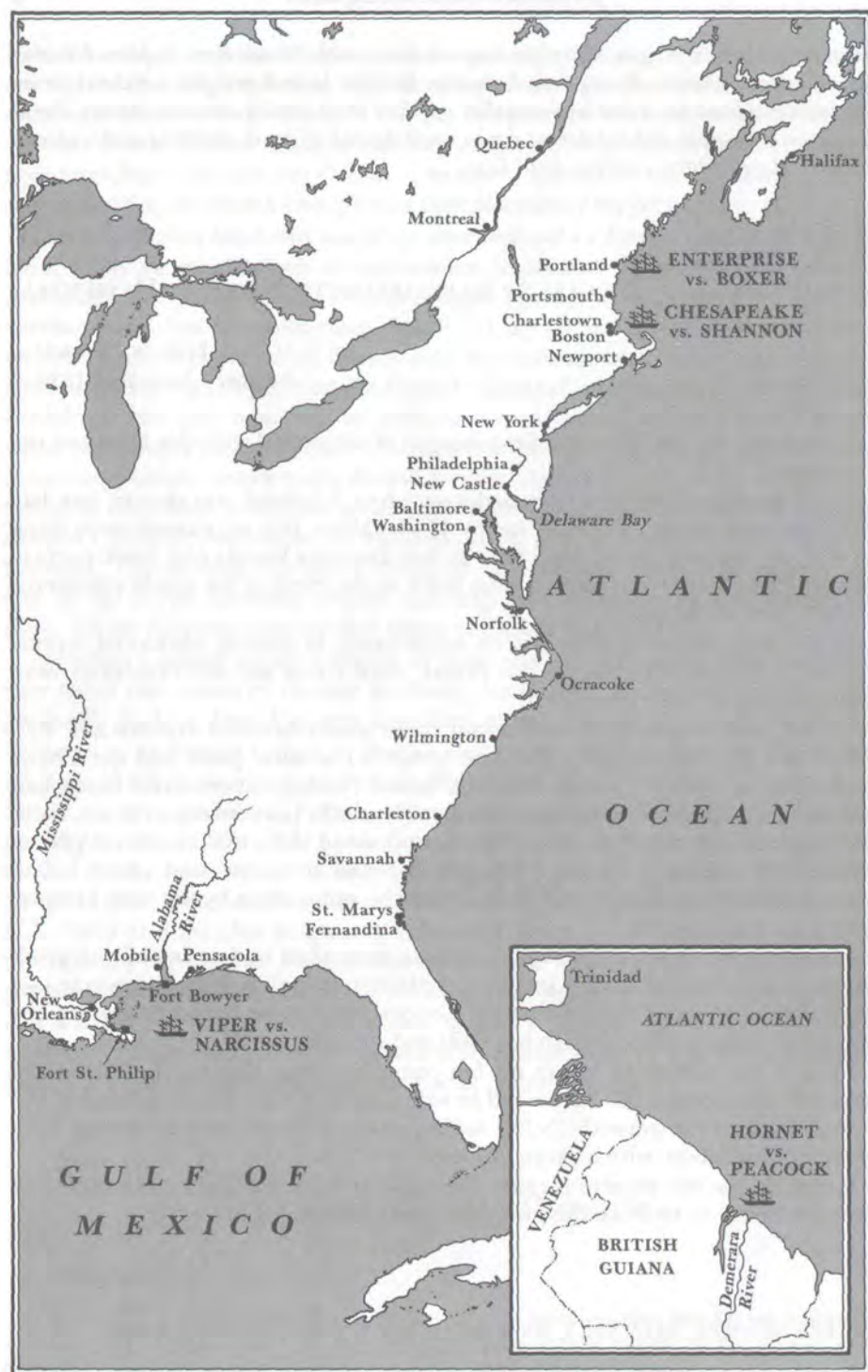
Map 1. Atlantic and Gulf Theaters