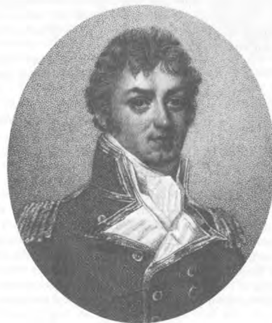
Captain Philip Bowes Vere Broke, R.N.