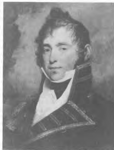
Master Commandant James Lawrence

The Shannon mounts twenty four Guns upon her broadside, and one light Boat Gun, Eighteen pounders on her Main deck, and Thirty two pound Carronades on her Quarter deck and Forecastle; and is manned with a Complement of Three Hun-