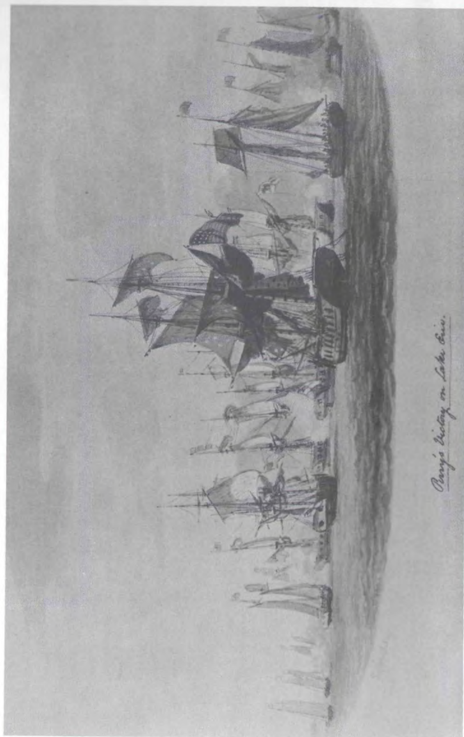
Perry's Victory on Lake Erie.