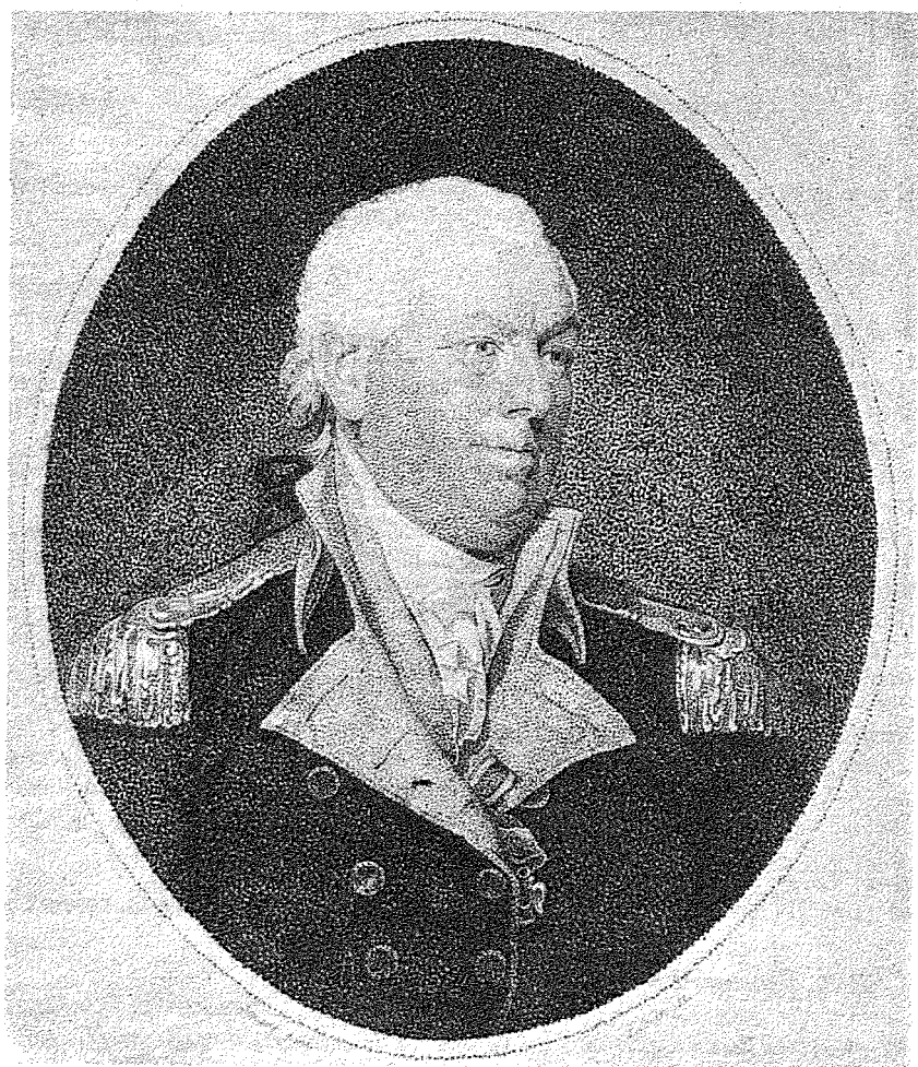
CAPTAIN JOHN BARRY, U. S. NAVY.