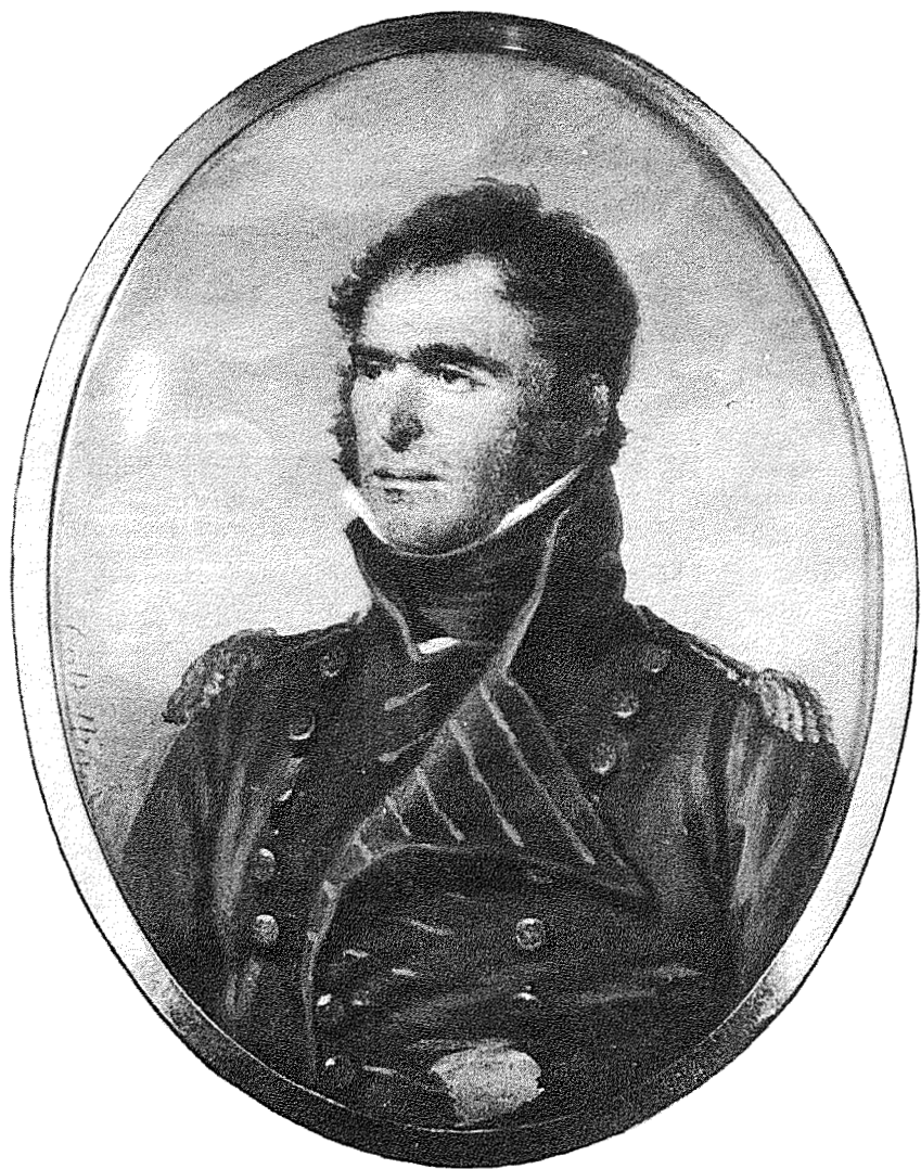
COMMODORE JOHN RODGERS, U. S. NAVY.