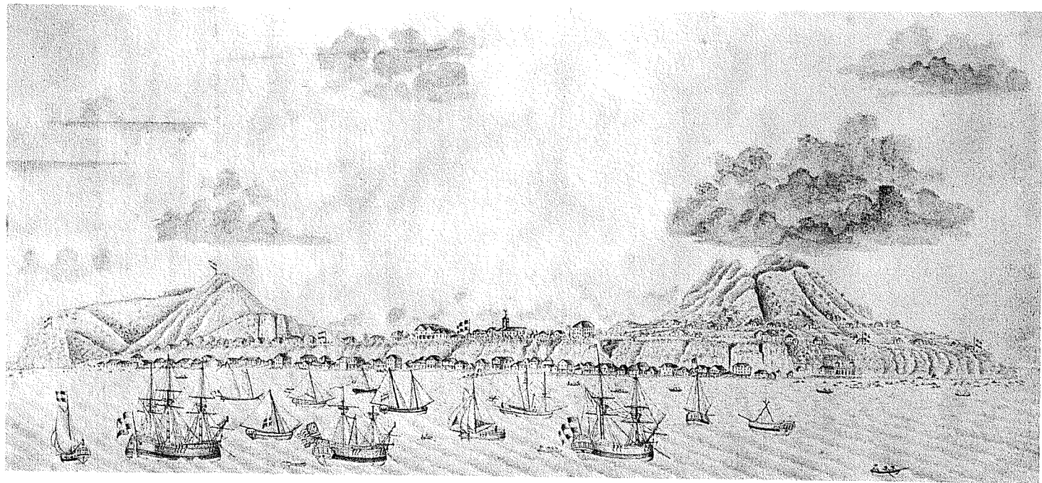
Oranjestad Harbor, St. Eustatius