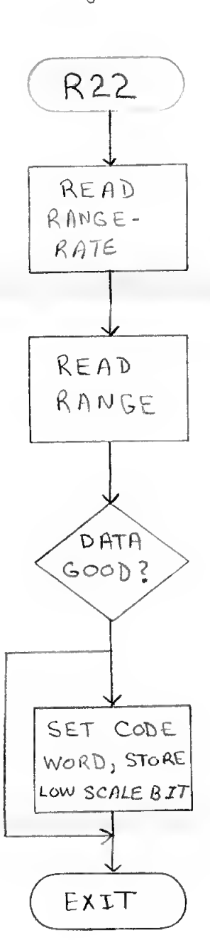
R22 and R65 Radar Reads