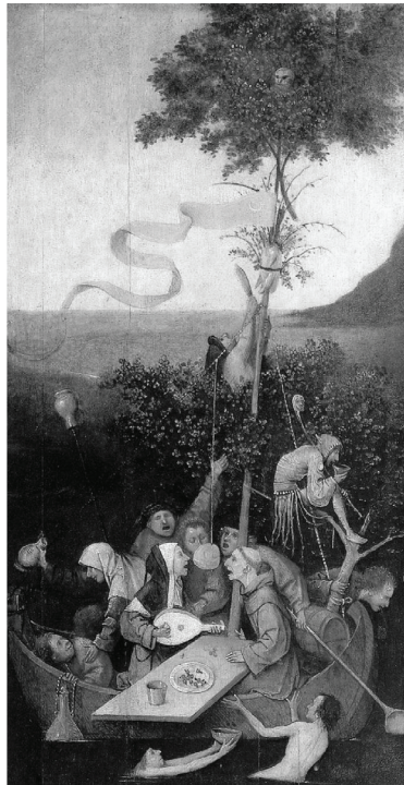
Figure 1. Hieronymus Bosch, Ship of Fools (1490–1500)