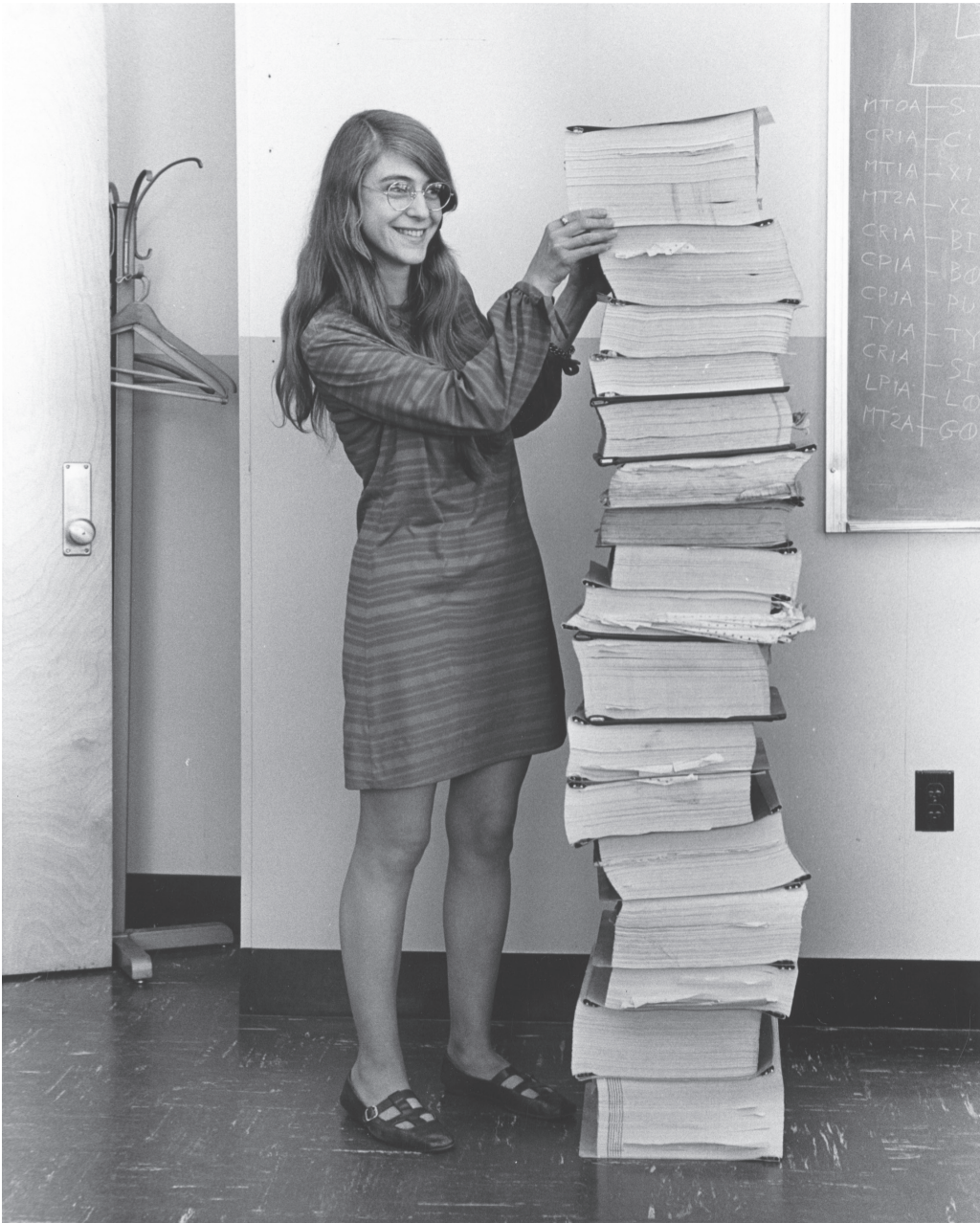
Figure 3. Margaret Hamilton standing next to stack of Apollo Guidance Computer code.