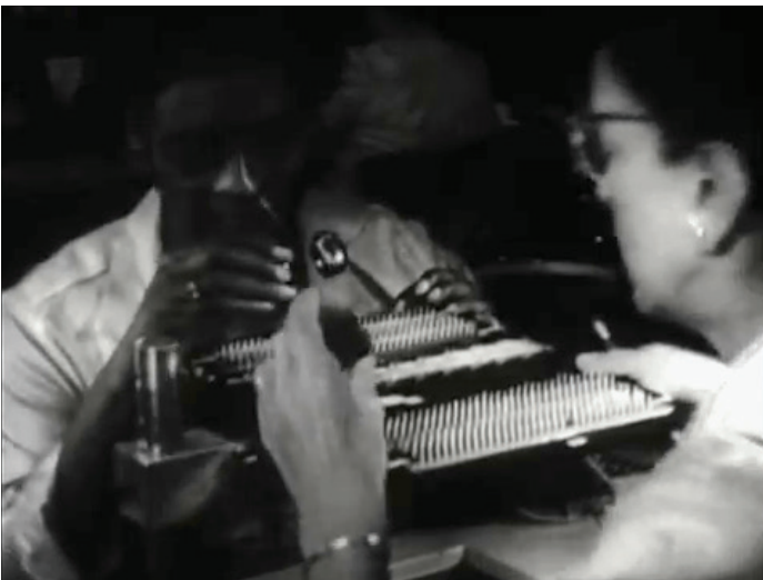
Figure 2. Teamwork was required to braid the wires through the cores. Screenshot from Computer for Apollo , directed by Russell Morash (Cambridge, MA: MIT Science Reporter, 1965).