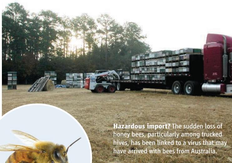
Hazardous import? The sudden loss of honey bees, particularly among trucked hives, has been linked to a virus that may have arrived with bees from Australia.

The abrupt loss of bee colonies in the United States, first reported last fall, has been a big mystery. Although some scientists aren't convinced that the phenomenon—based largely on anecdotal reports from beekeepers—is really any different from past declines in bee populations