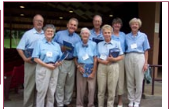
Usher volunteers preparing for duty

“There were 60 ushers this season. Twenty five have been ushering 3 years or more, and they put in 255 usher nights. That’s a lot of volunteer time and all done with pleasure.”