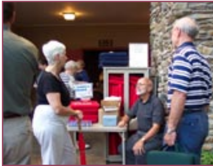
Cushions for rent or sale