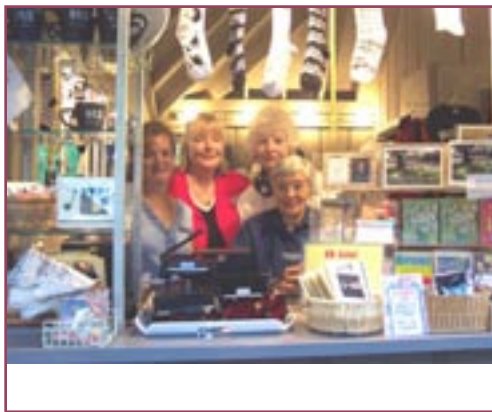
Harmony House volunteers prepare for sales