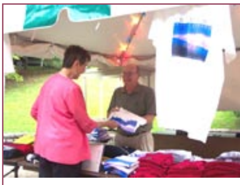
Sales under the tent