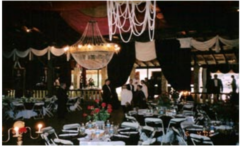
The Paris Opera House (a.k.a. Straus Auditorium)