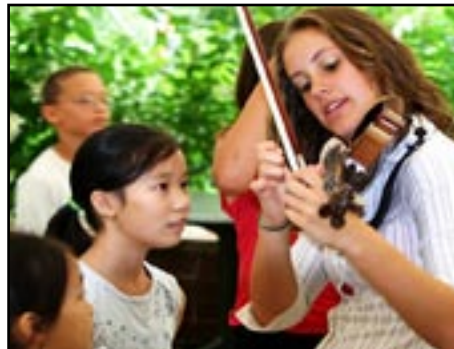
BMC student explaining the violin to young person