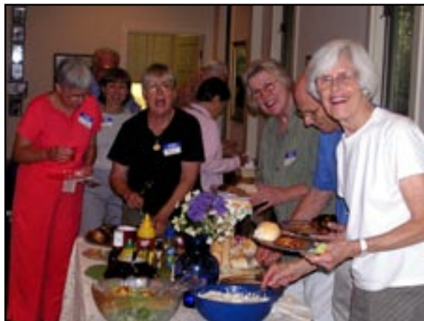
Harmony House committee members enjoyed a buffet supper at the end of the season. Everyone had a good time. (Of course, it rained!)

Sales went up, up, up in the beginning of the summer (on a chilly registration day, we sold more than $3,000 in apparel!) and down, down, down as the temperature soared and the humidity hit 90%!