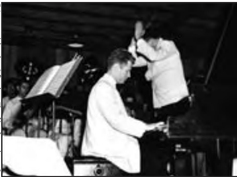
Van Cliburn performs at BMC