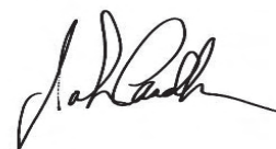
President, Brevard Music Center

On behalf of our students, staff and trustees – THANK YOU – for all that you do for us. Enjoy the season!