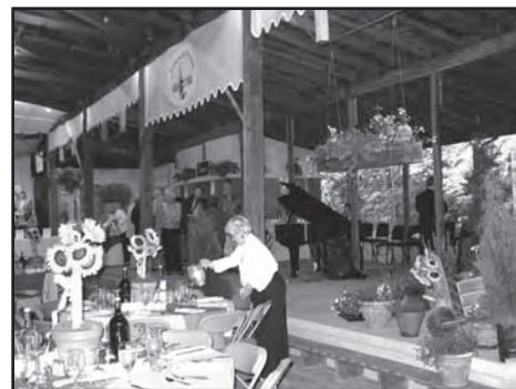
Volunteer preparing dinner table