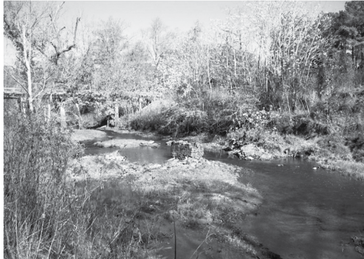
Link Spring lot on the Eno