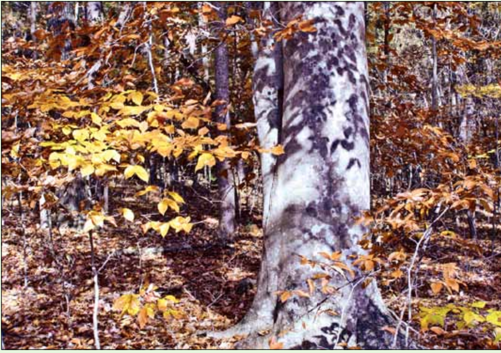
Standing before an American beech is like greeting an old friend.