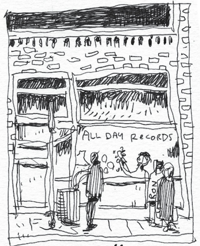
ILLUSTRATION BY PHIL BLANK

PACKING BOXES paper, paper sheets, some bubble wrap --CH (336) 209-1511