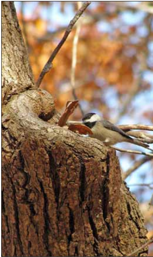
Little chickadee takes a turn at a tree-cavity watering hole.