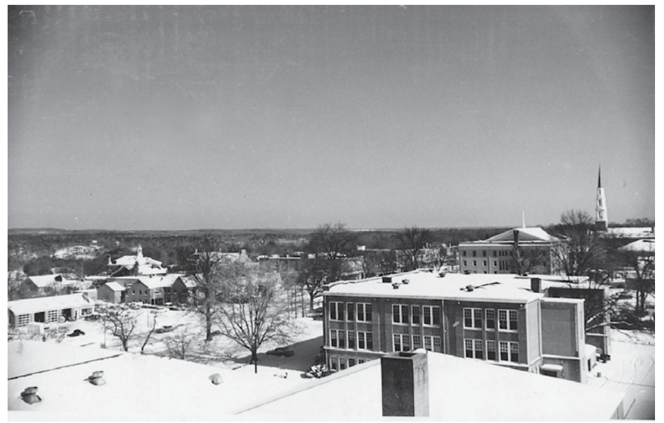
Chapel Hill Elementary School, 1965