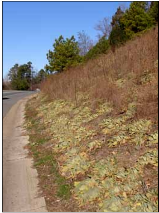
A carpet of roadside mulleins