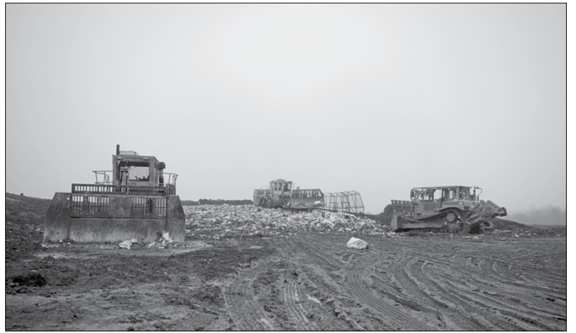
The Orange County Landfill has been open on Eubanks Road since 1972. Orange County and town officials confirmed their intent to close the landfill in 2013 at a meeting last week.

and Carrboro voiced concern over the high cost of taking their trash to Durham, as it would cost the towns a combined estimated $750,000 a year, as well as the discontent of having no control over where their trash goes from Durham.