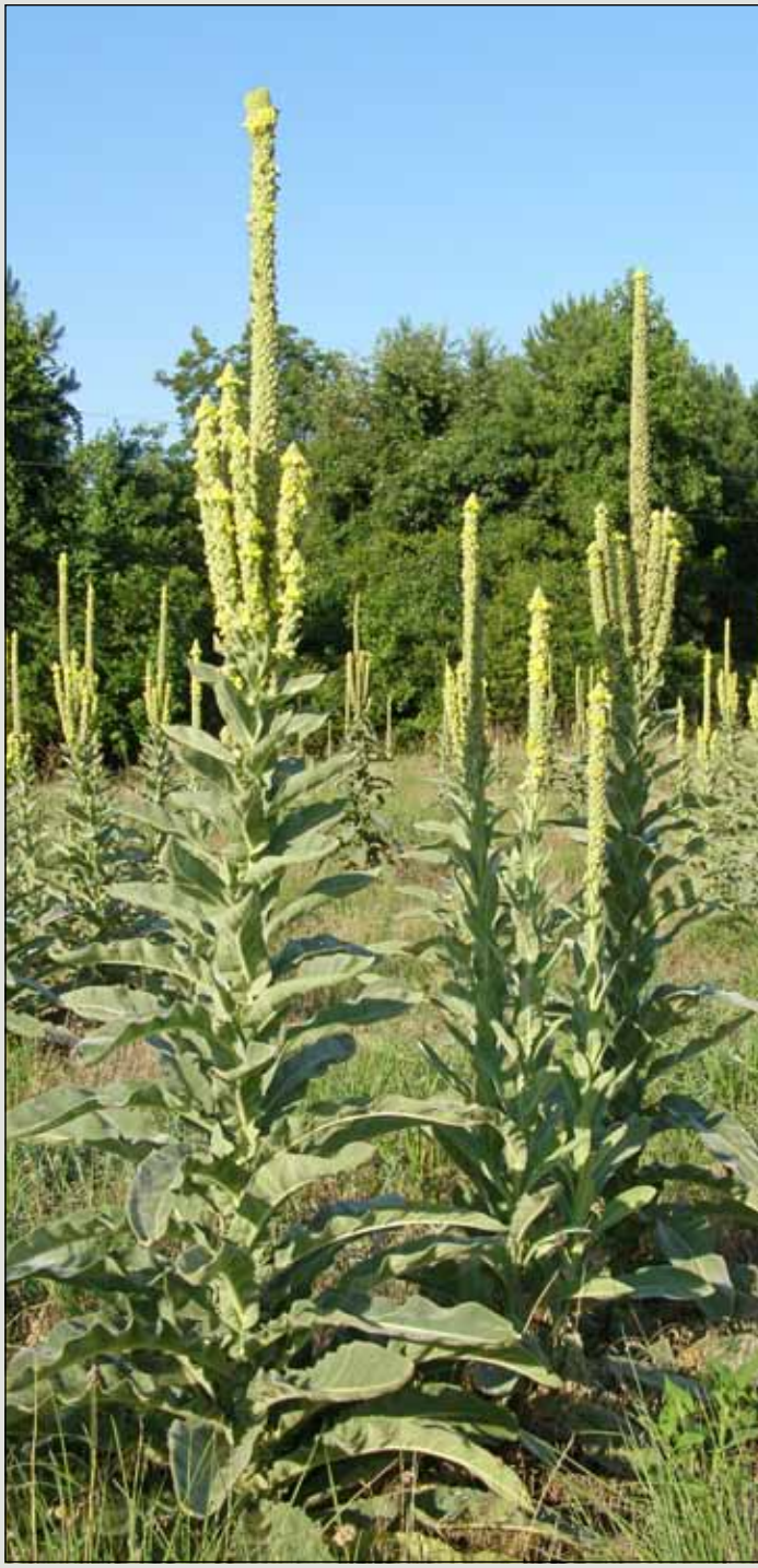
Mullein stems, like people, standing in a field

In moderation, mullein is an engaging garden plant. I vividly remember a visit to that grand garden at Chatsworth, home of the Duchess of Devonshire in central England. To my inquiry about the mulleins growing haphazardly along