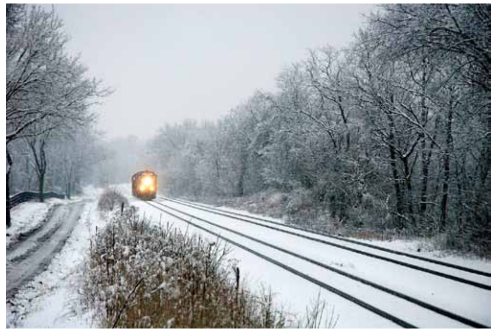
Helpers on the Met