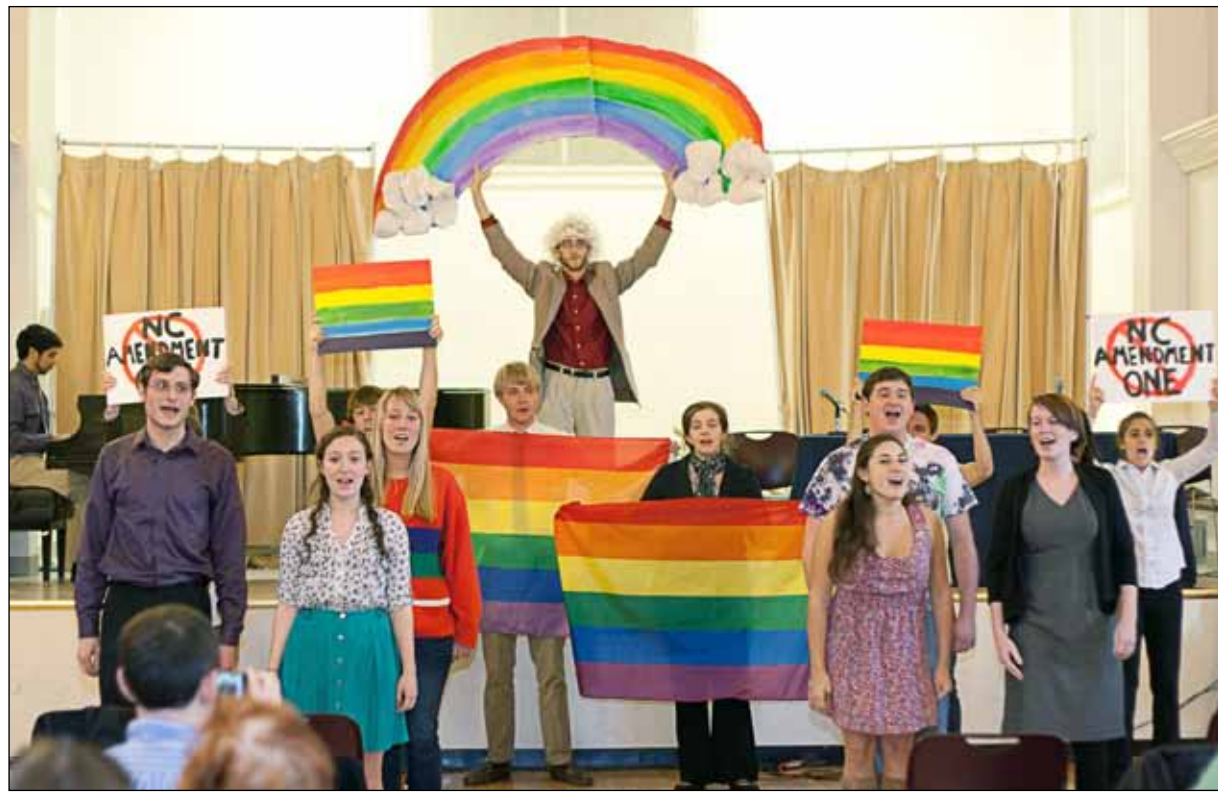
The cast sings and kicks their way through the grand finale of Amendment One: The Musical! . They performed the play at the conclusion of the Orange County Human Relations Month Forum at the Carrboro Century Center on Sunday.