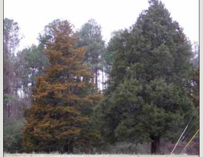
Male flowering red cedar (left) looks diseased next to a female tree (right).

Email Ken Moore at flora@ carrborocitizen.com. Find previous Ken Moore Citizen columns at The Annotated Flora (carrborocitizen.com/ flora).