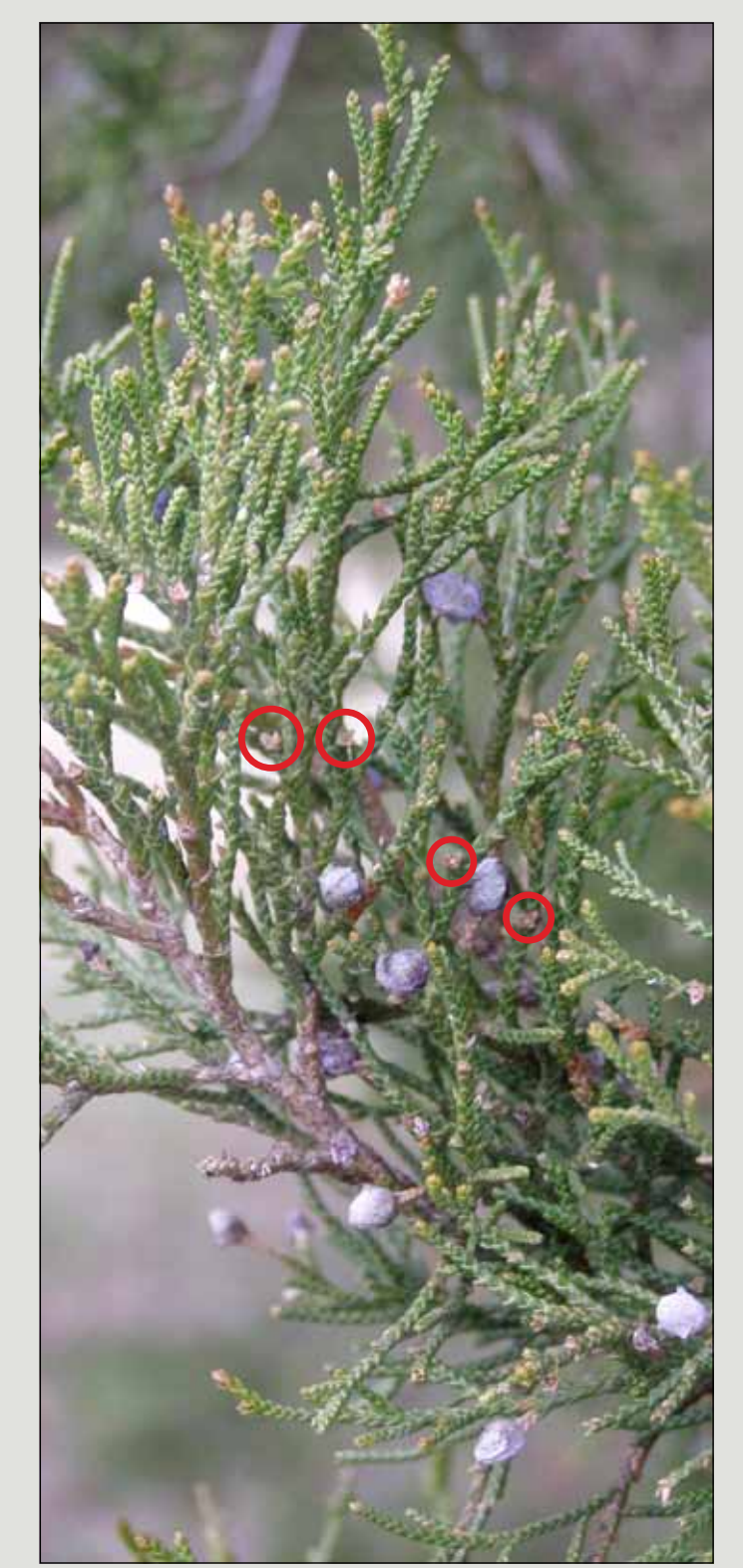
Female flowers (circled in red) are barely discernible on red cedar.