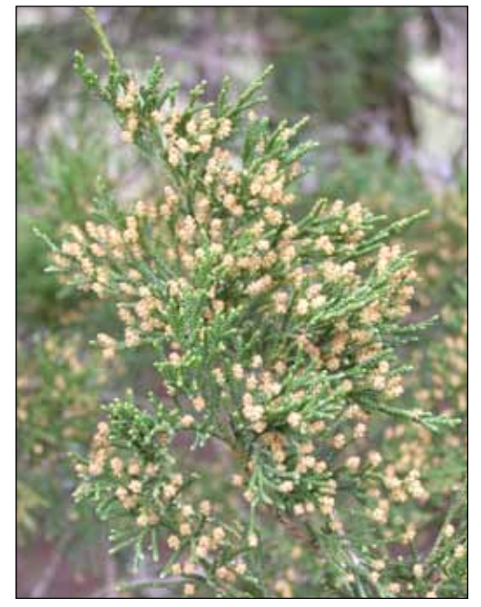
Male pollen-bearing, cone-like structures are now visible on red cedars.