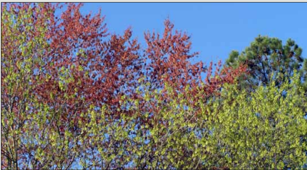
Yellow-green flowered Southern sugar maple (in front) contrasts with the red seeds of red maple (behind).