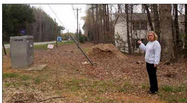
Duke Energy recently clear cut the right-of-way on the Homestead Road side of Kimberly Willardson's property on the corner of Homestead and Seawell School roads.

Duke Energy cut down trees, saplings and underbrush, including nearly everything shielding Willardson's home from Homestead Road, in order to maintain the right-of-way underneath their power lines.