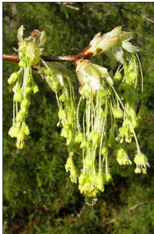
Pendulous green flowers of Southern sugar maple are worth a 'closer look.'