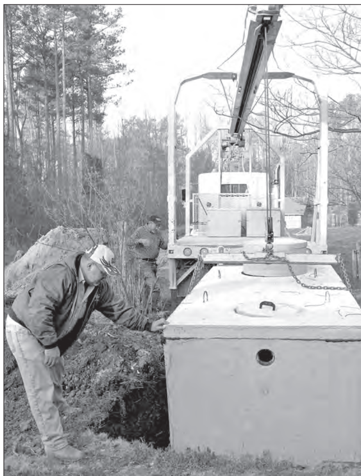
A crew from Moldenhauer Landscaping lowers a cistern into the ground.

We don't have to search far to find local examples of homes using cisterns. Historically in the South, cisterns were buried brick vaults with a hand pump. When I arrived in rural Tennessee in 1960, I lived in a pre-Civil War home that had an underground cistern with a hand pump outside and another in the kitchen. Last fall, I visited Ocracoke and noticed the remains of many old brick cisterns. Cisterns went out of fashion when deep wells with electric pumps and municipal water systems became the norm. Droughts and increases in population have begun to stress our municipal systems, and we have come to realize that ground water is a limited resource. The cistern is perhaps the best solution for increasing our personal