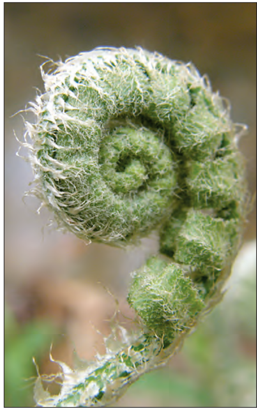
Fiddlehead of Christmas fern is protected by a hairy jacket