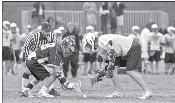
Chapel Hill High lacrosse beat Carrboro High, 14-1, on April 8.