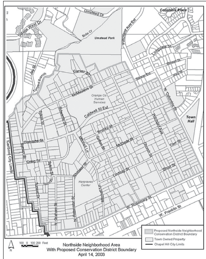
The Northside Conservation District defines the Northside neighborhood as stretching from Tanyard Branch Trail to the north to West Rosemary Street to the south and from North Columbia Street to the east to the Carrboro city limit to the west.

Edwards learned this lesson when she first went to an integrated school as a seventh-grader at Chapel Hill Junior High. “My first day, I was spit on, kicked on and called ‘nigger’ all day long,” Edwards says. But as she walked down Church Street, with the homes of whites lining the left side of the road and the homes of blacks on the right, something changed. “The closer I got to McDade Street – that’s when all that