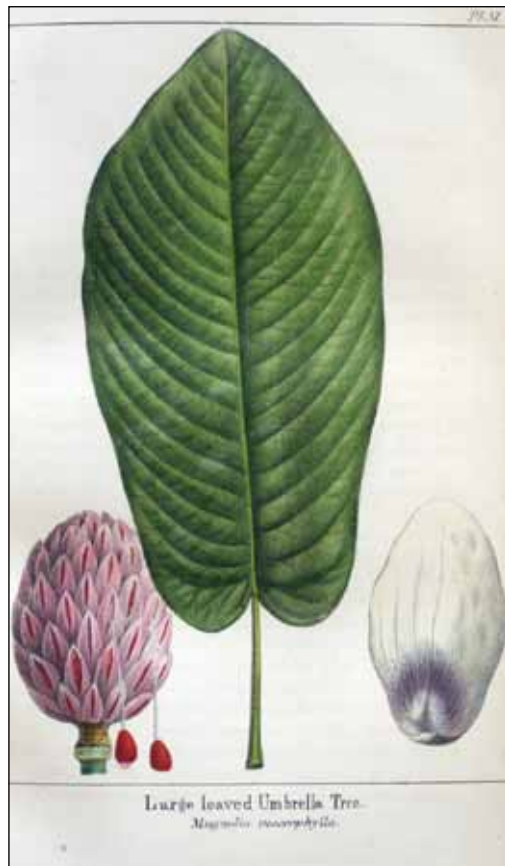
Famed botanical illustrator Redouté's rendering of Magnolia macrophylla