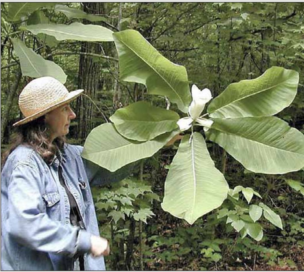
Redlair owner Sabine Rankin admires a bigleaf magnolia.