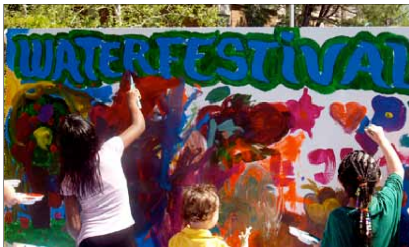
Children of Abbey Court Apartments express their artistic creativity during the Water Festival on Sunday. The festival, which celebrates the Burmese New Year, brought the community together through a combination of water balloons, art, music and good food.