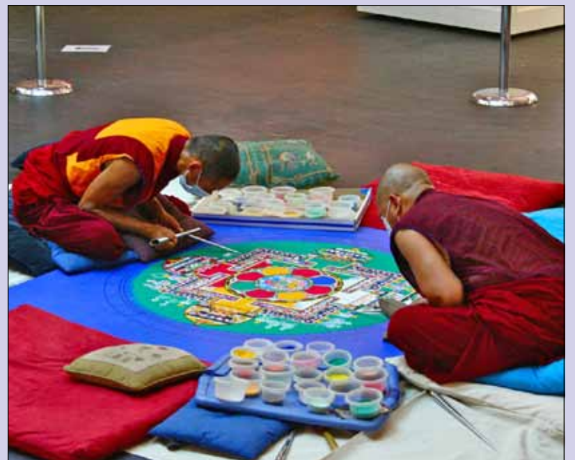
Monks from the Drepung Gomang Institute create a mandala at the old Chapel Hill Museum.