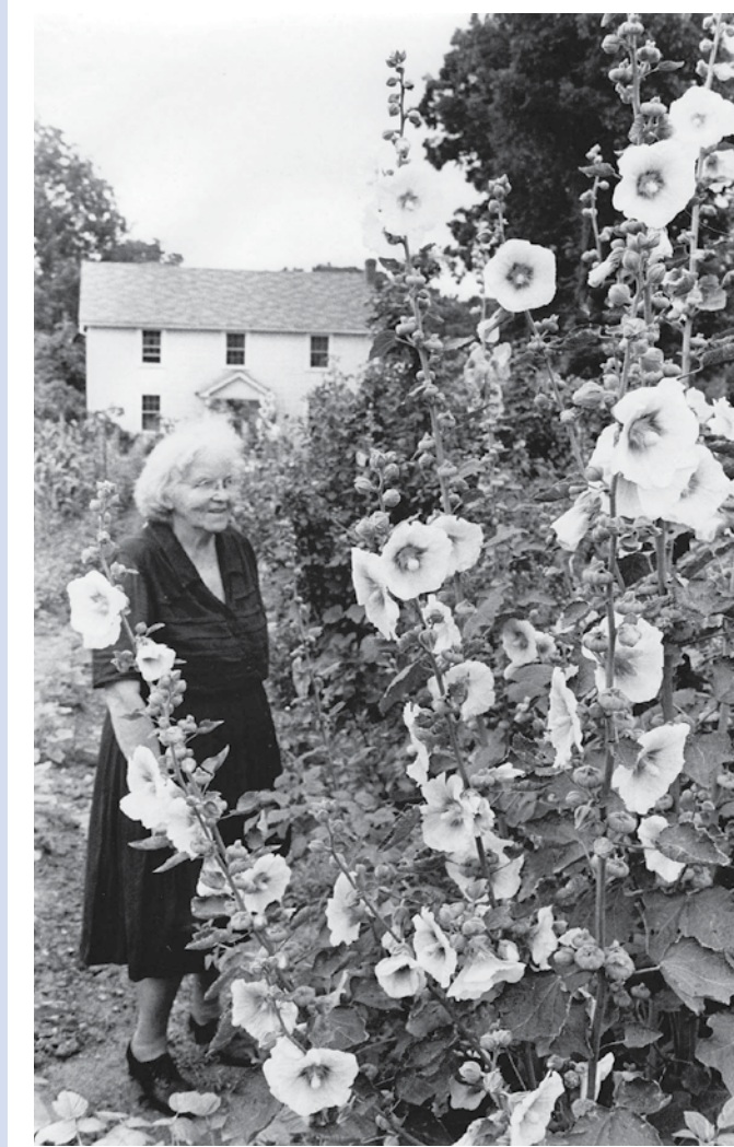
Pave Paradise, 1968