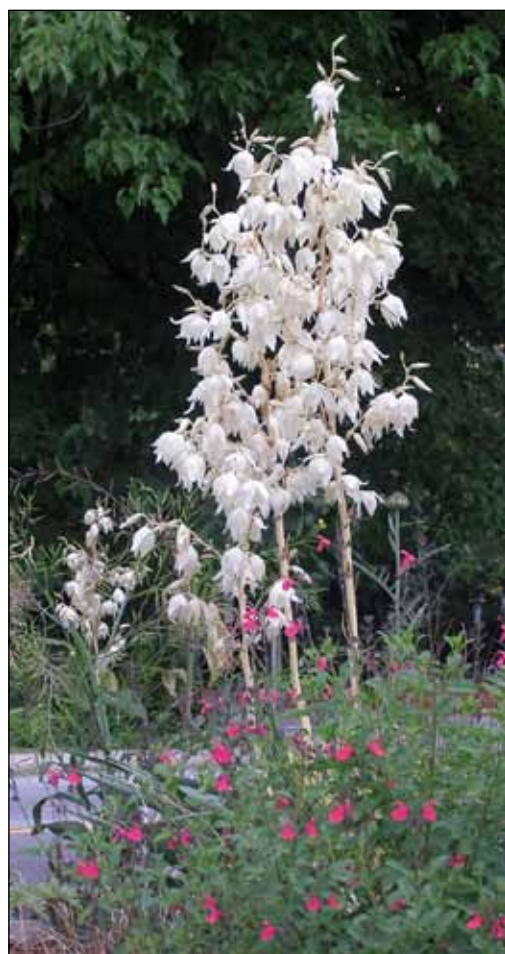
Flowering yuccas punctuate Chapel Hill Tire's landscaped corner in Carrboro.