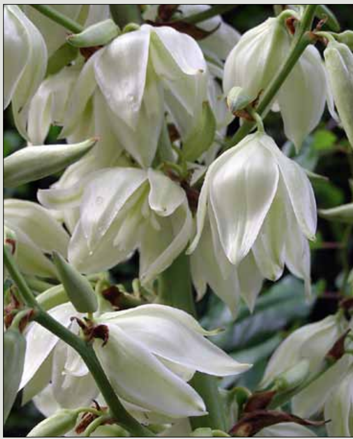
Yucca flowers are characteristic of the lily family.

Yuccas, like the onions and garlic in my camping concoction, are in the lily family, or at least they were until recently. Taxonomists are still working on new classifications within the former lily family. Meanwhile, take a closer look