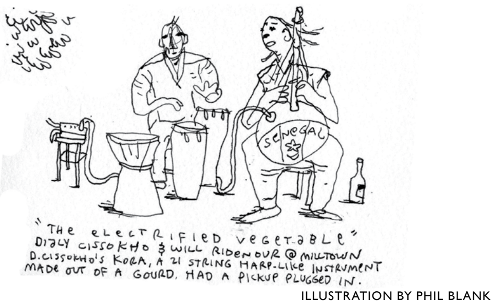
ILLUSTRATION BY PHIL BLANK