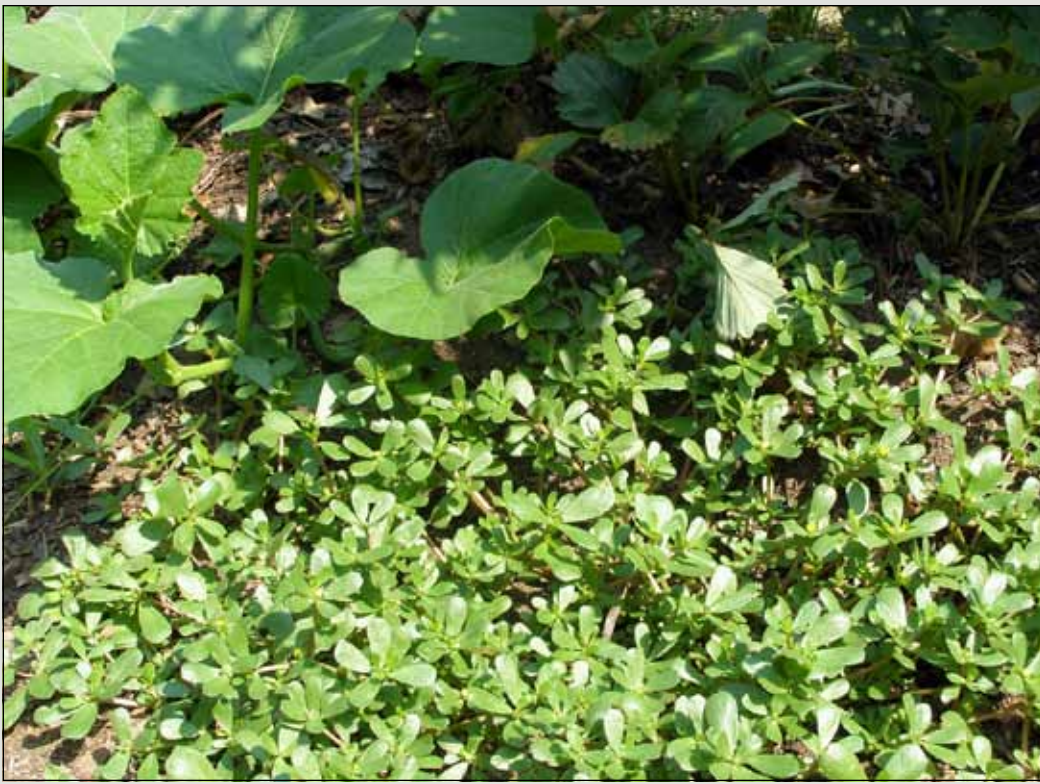
Drought-tolerant purslane makes a living green mulch beneath a squash plant.