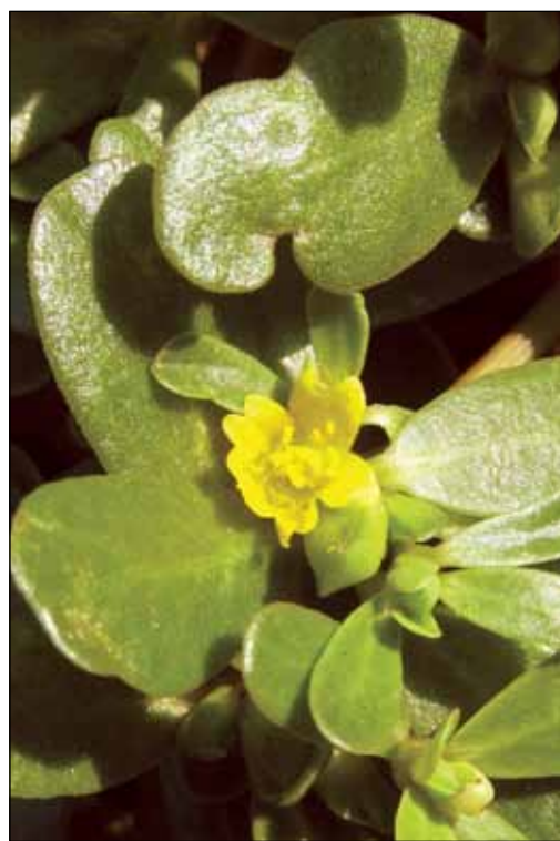
Tiny quarter-inch flowers of succulent purslane open for only a couple of hours, in mid-morning.