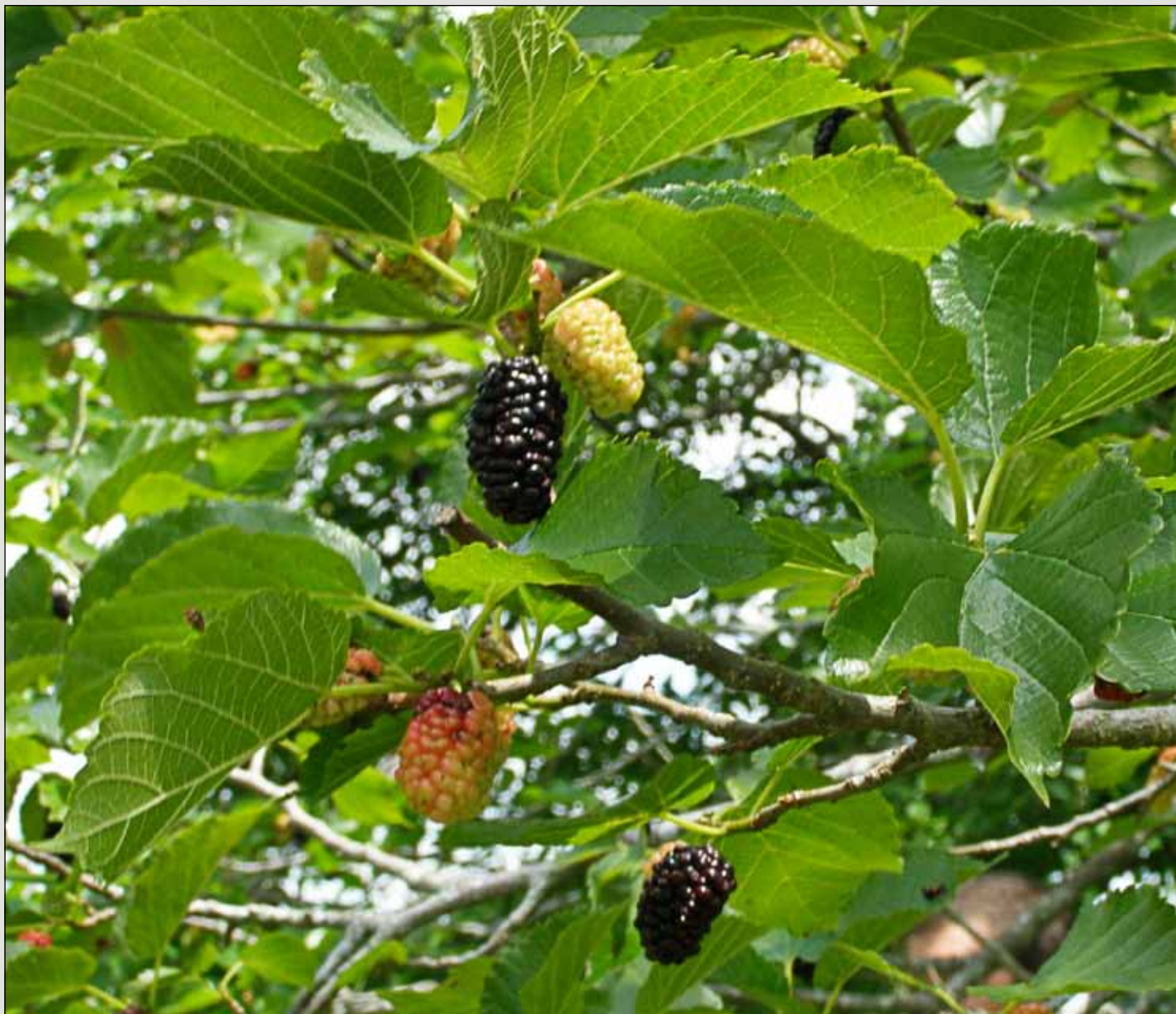
Mulberry cultivar "Silk Hope" produces for more than six weeks.