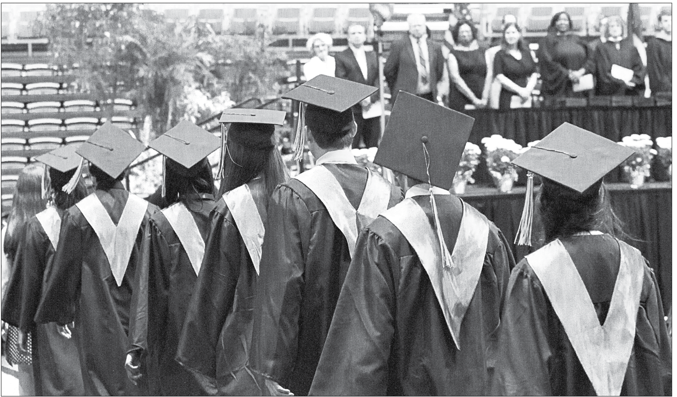
Carrboro High graduates march into the Dean Dome on June 9 for the school's 2012 graduation ceremonies.