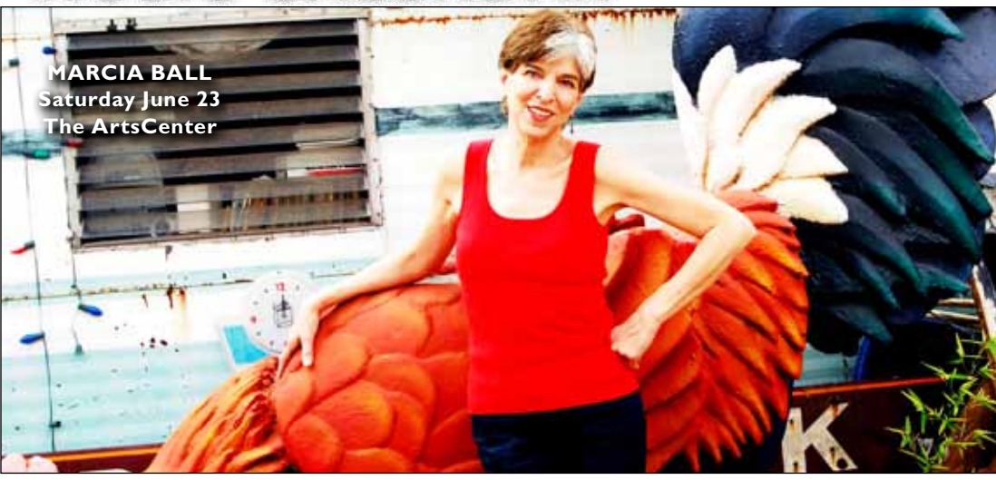
MARCIA BALL Saturday June 23 The ArtsCenter