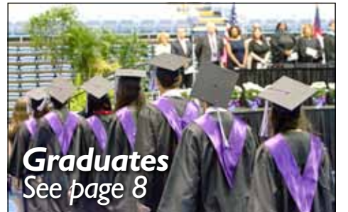
Graduates See page 8