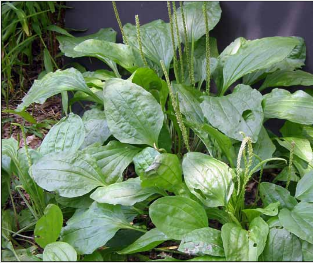
Consider common plantain a deer-proof hosta look-alike.