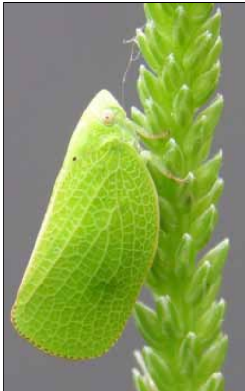
A green planthopper investigates a plantain flower spike.