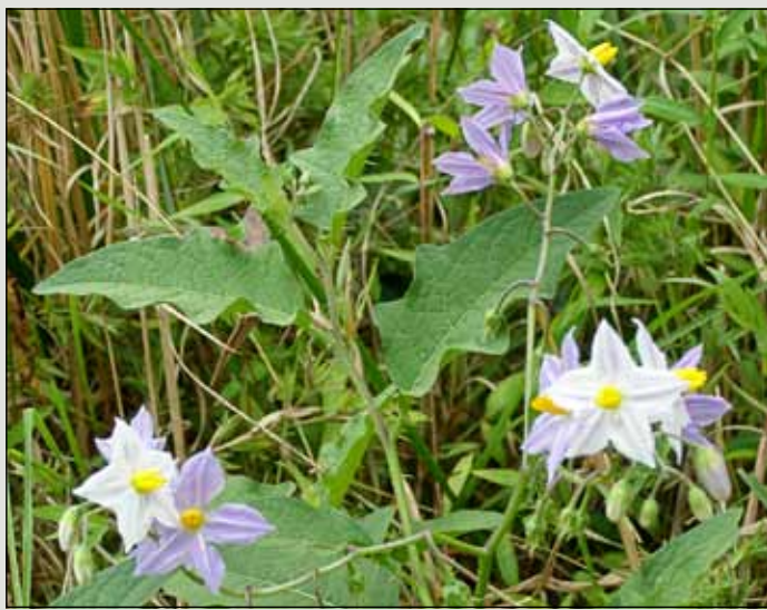
Needle-sharp thorns protect horse-nettle plants.

You definitely should tread softly when moving barefoot