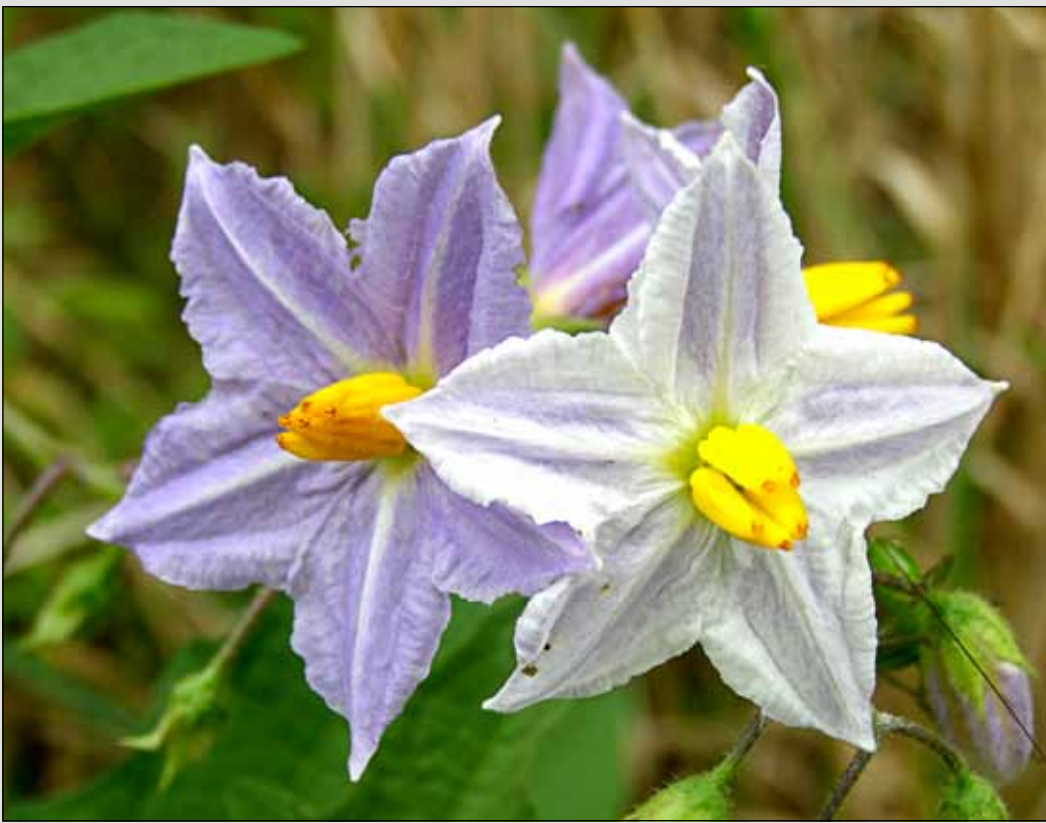
Stoop low to enjoy the beauty of horse-nettle flowers.