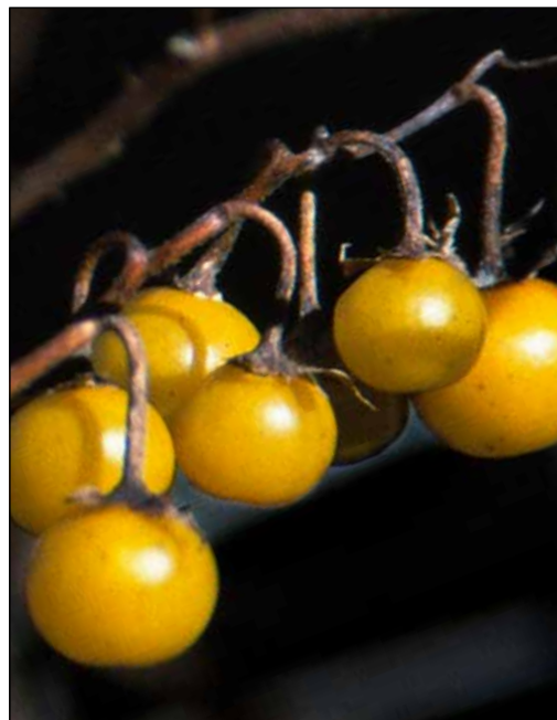
Beware, poisonous berries of horse nettle look like cherry tomatoes.