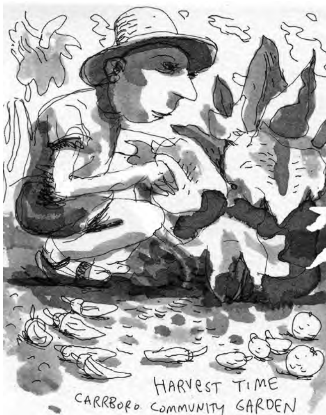
ILLUSTRATION BY PHIL BLANK