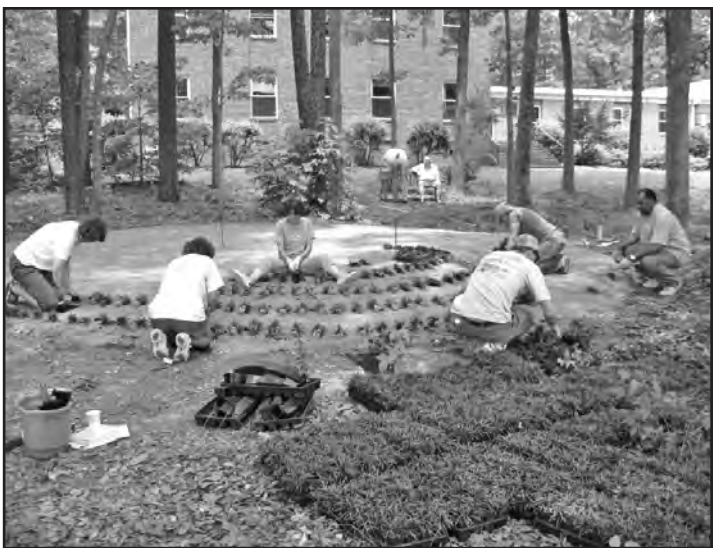
A labyrinth, seen above under construction, serves as a spiritual exercise for members of Aldersgate United Methodist Church.