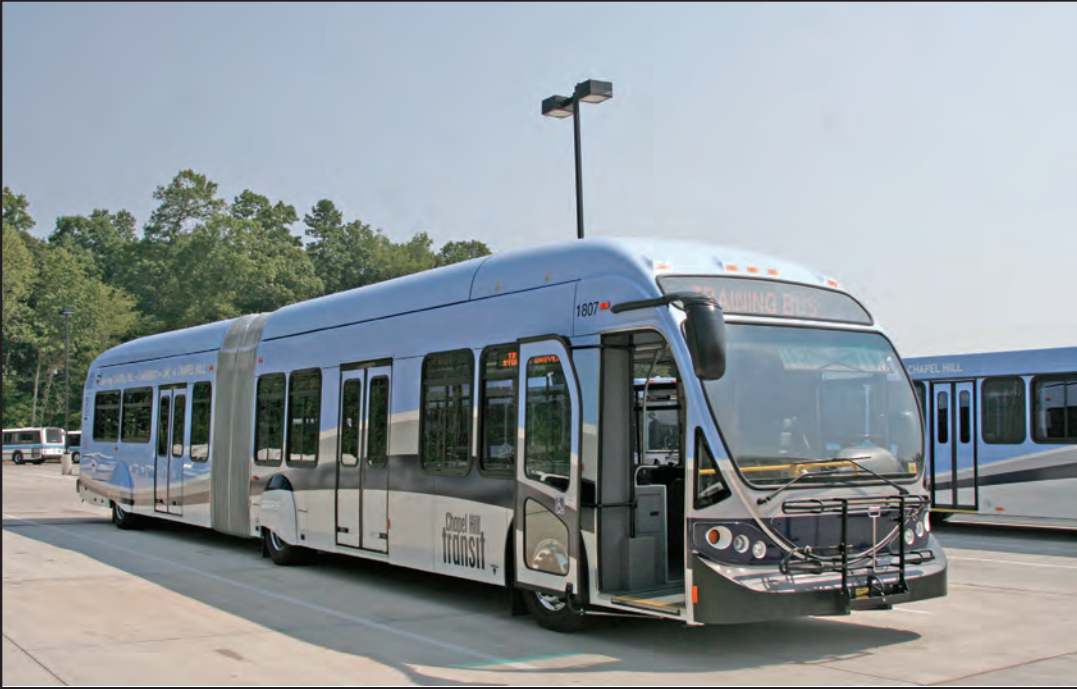
One of the new articulated buses.