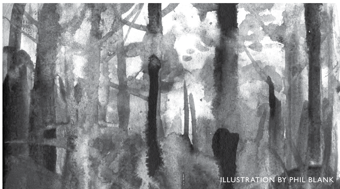
ILLUSTRATION BY PHIL BLANK

Latin Jam — Betto teaches popular Latin dances, such as mambo, salsa, cha cha and merengue. Carrboro Century Center, 7:30-9pm $3 (919)918-7364