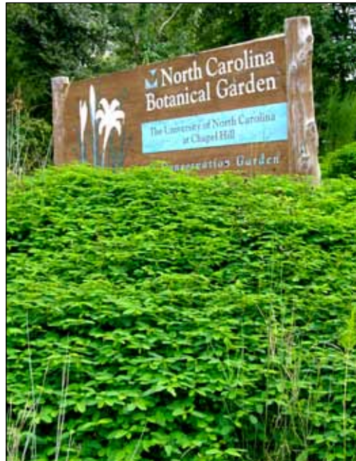
Nature planted the beautiful dwarf partridge pea ground cover for the botanical garden entrance sign.