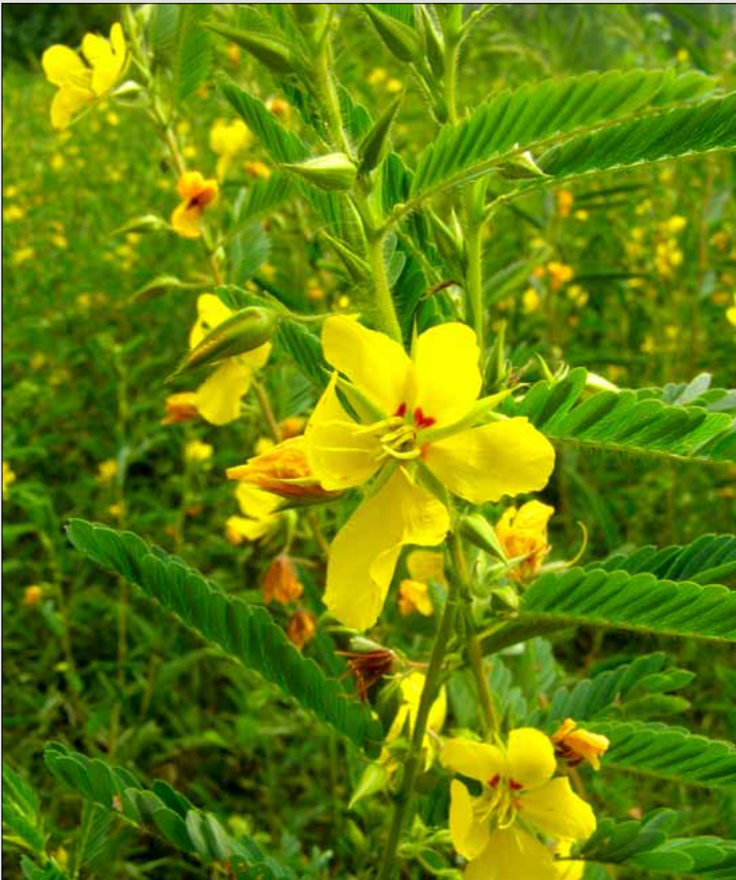
Flowers of common partridge pea are large enough to be showy.