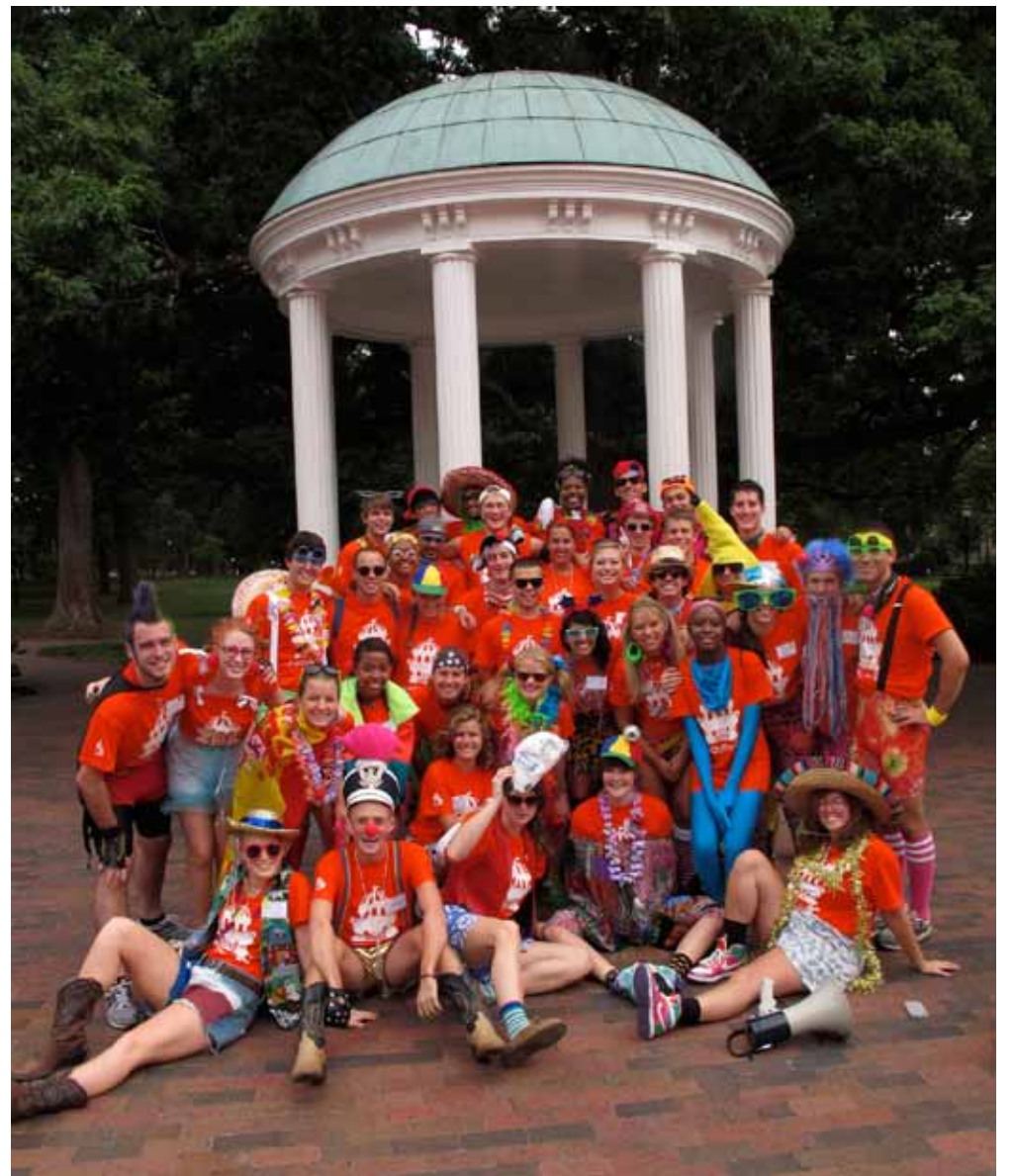
The kids are back in town

Email Ken Moore at flora@carrborocitizen.com . Find previous Ken Moore Citizen columns at The Annotated Flora ( carrborocitizen.com/flora ).