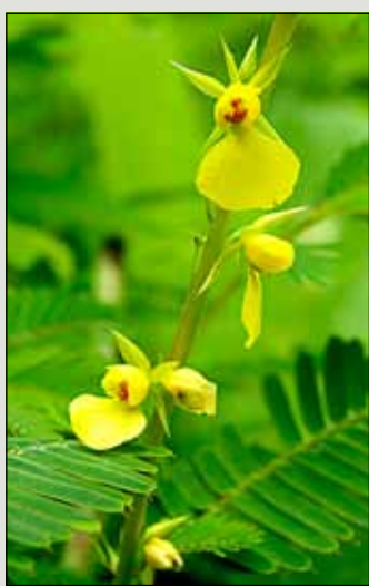
You have to take a very close look to see the flowers of dwarf partridge pea.

Most likely that superb dwarf partridge pea ground