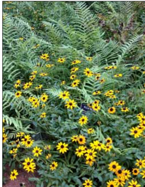
Black-eyed Susan blooms and southern shield fern fronds contrast nicely with one another.