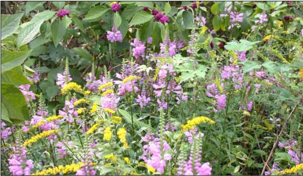
Pink blooms, purple berries and yellow spikes of obedient plant, American beautyberry and goldenrod