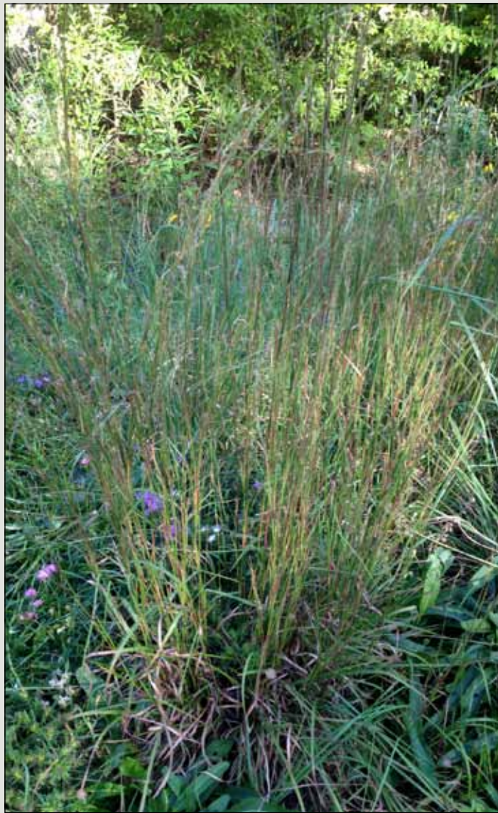
Little blue stem in the Piedmont habitat garden

Email Ken Moore at flora@carrborocitizen.com . Find previous Ken Moore Citizen columns at The Annotated Flora ( carrborocitizen.com/flora ).