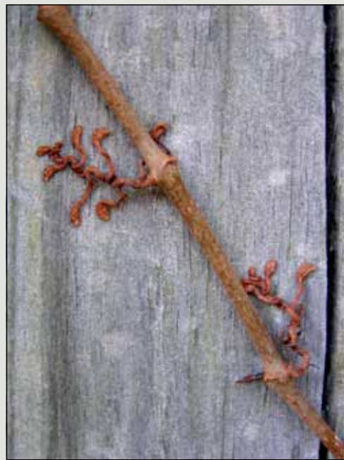
Virginia creeper vines climb via tiny holdfasts.