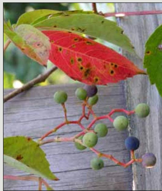
Beautiful Virginia creeper dark berries on red stems signal a tasty treat for birds.