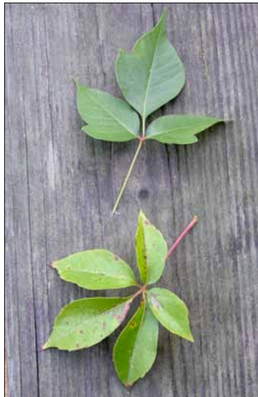
Leaves of three, let them be/Leaves of five, stay alive