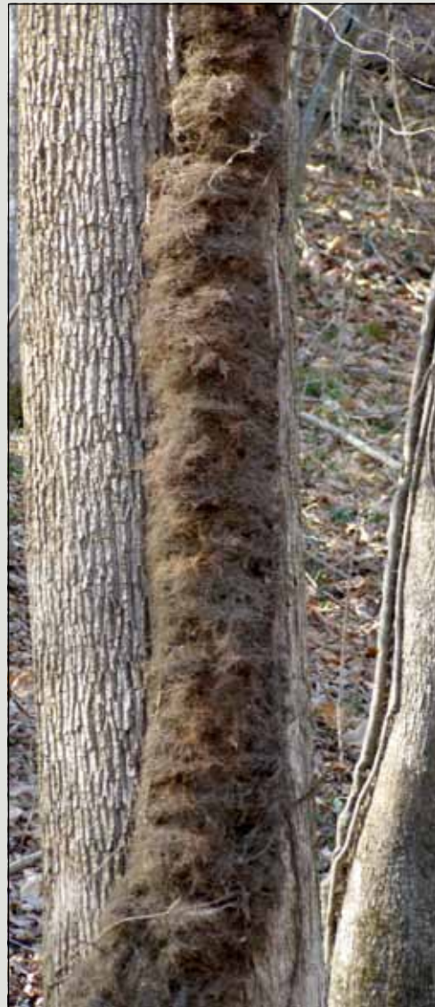
Tree-climbing poison ivy vines are dark and densely hairy.