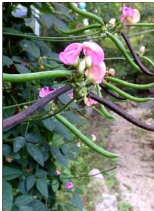
Wild bean displays flowers and fruit like a whirling ballerina.