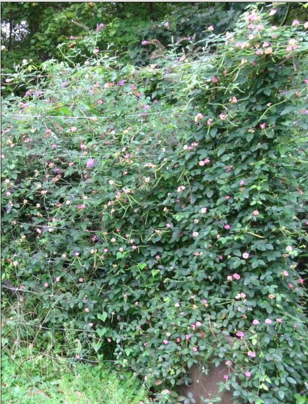
Wild bean can be a garden feature if given freedom to climb a garden trellis.