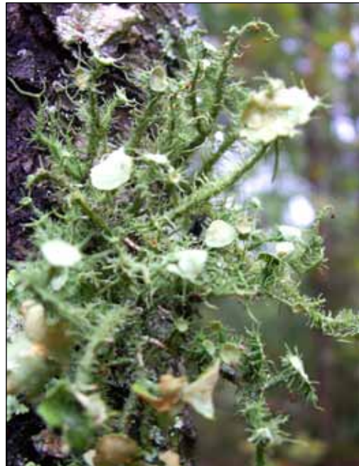
Bushy-beard lichen, Usnea strigosa , is a common fruticose form found on trees.