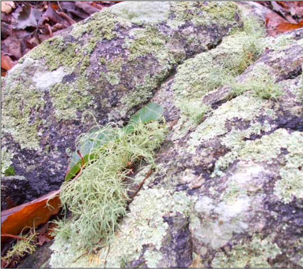
At least six different species of crustose, foliose or fruticose lichens are growing on this boulder surface.