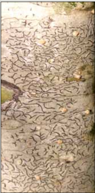
Dark squiggly lines on a holly tree trunk are common script lichens, Graphis scripta .

consider lichens not as individuals, but entire ecosystems in miniature.