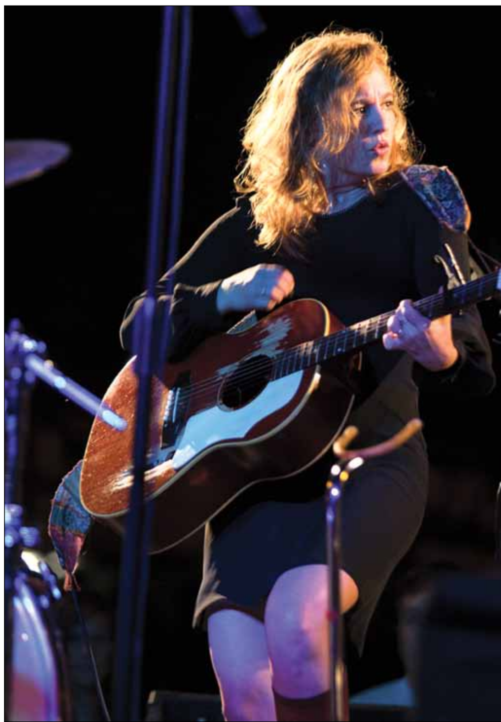
TAKIN' IN TIFT - Tift Merritt performs for a crowd of nearly 4,000 concertgoers who came out for the Cradle in the Commons event last Friday. Merritt, Megafaun and Mandolin Orange performed. The concert, which was held in the Town Commons and drew residents young and old out to enjoy some tunes and the near-perfect early-fall weather.