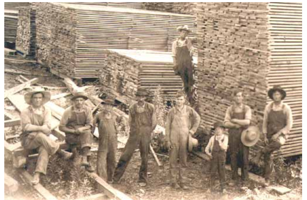
Roberson's Sawmill, 1930s?