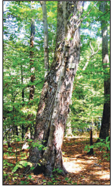
Impressive Red Maple, labeled, along trail in the Adams Tract.