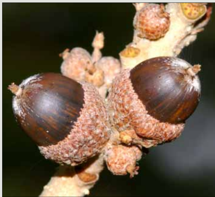
Mature post oak acorns