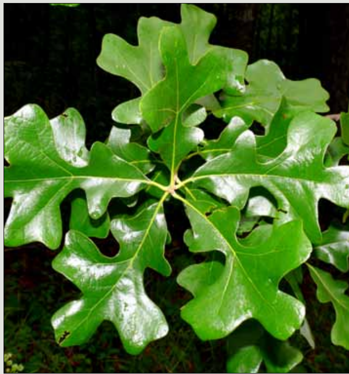
Post oak is a fairly common large tree that is typical of drier habitats.

Email Ken Moore at flora@carrborocitizen.com . Find previous Ken Moore Citizen columns at The Annotated Flora ( carrborocitizen.com/flora ).