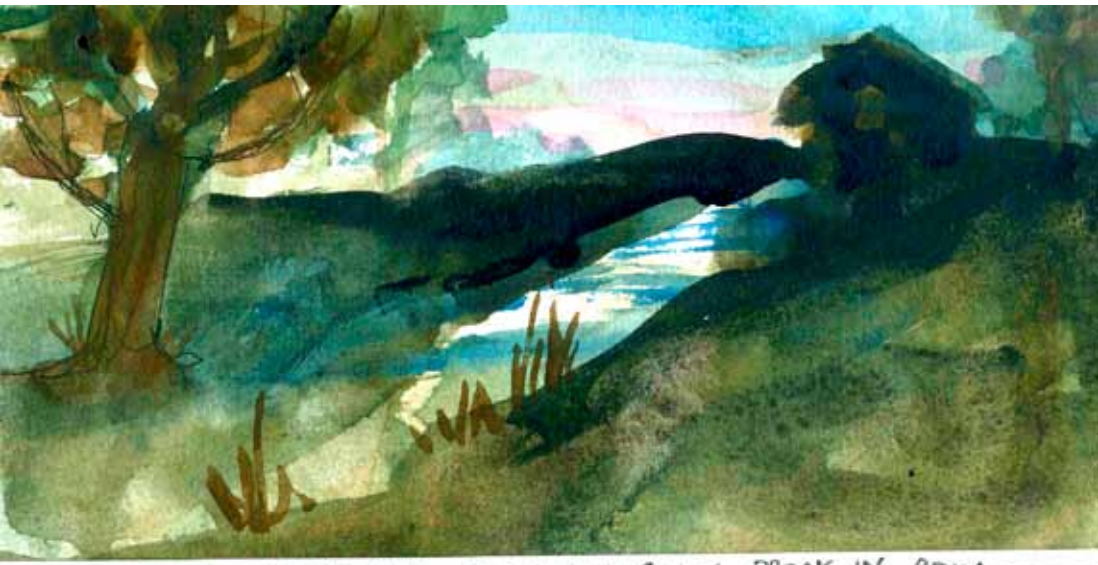
DRAWN FROM MEMORY. EARLY MORNING BREAK IN RAIN ILLUSTRATION BY PHIL BLANK