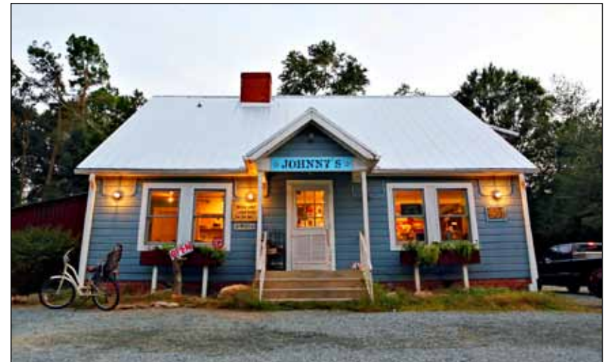
Exactly what form Johnny's on West Main Street will take has been a source of conflict for business owners, neighbors and other community members as the business has morphed over the past couple of years.