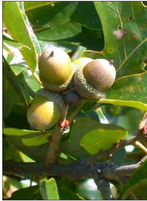
Post oak leaves with acorns