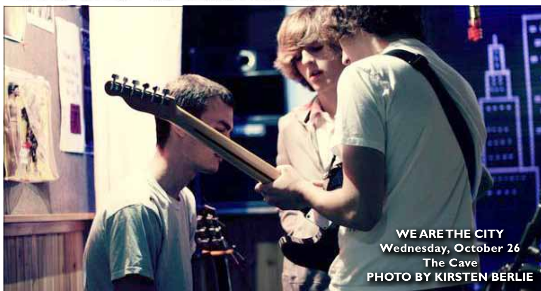
WE ARE THE CITY Wednesday, October 26 The Cave