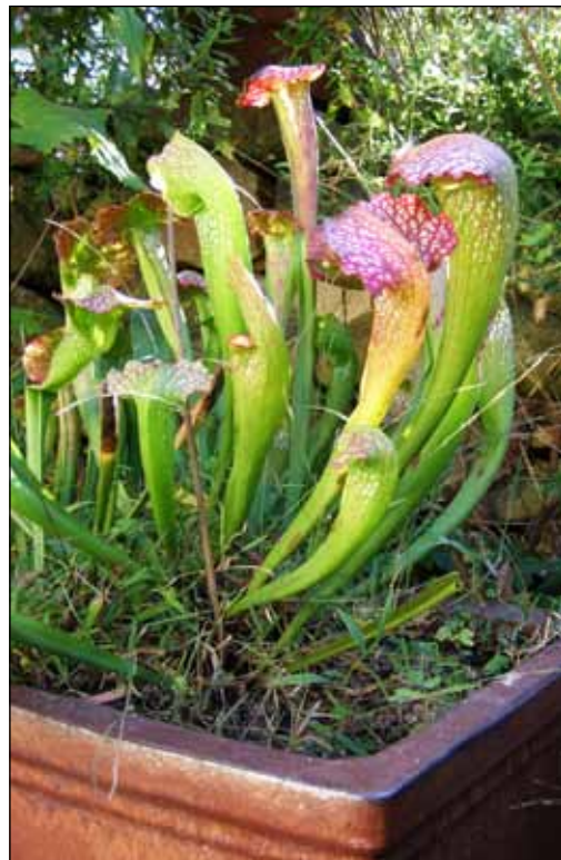
Bizarre hybrid pitcher plant, Sarracenia 'Mardi Gras,' is easy to grow in pots.