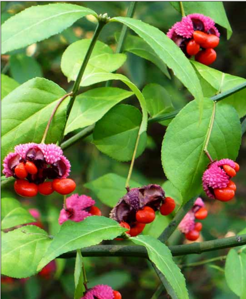
Seeds of hearts-a-bustin' literally burst from the heart of strawberry-shaped capsules.