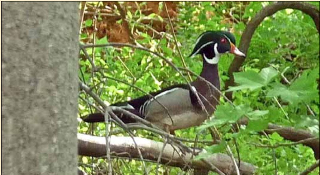
Wood ducks are sometimes sighted on the edge of Cane Creek Reservoir.

Email Ken Moore at flora@carrborocitizen.com .