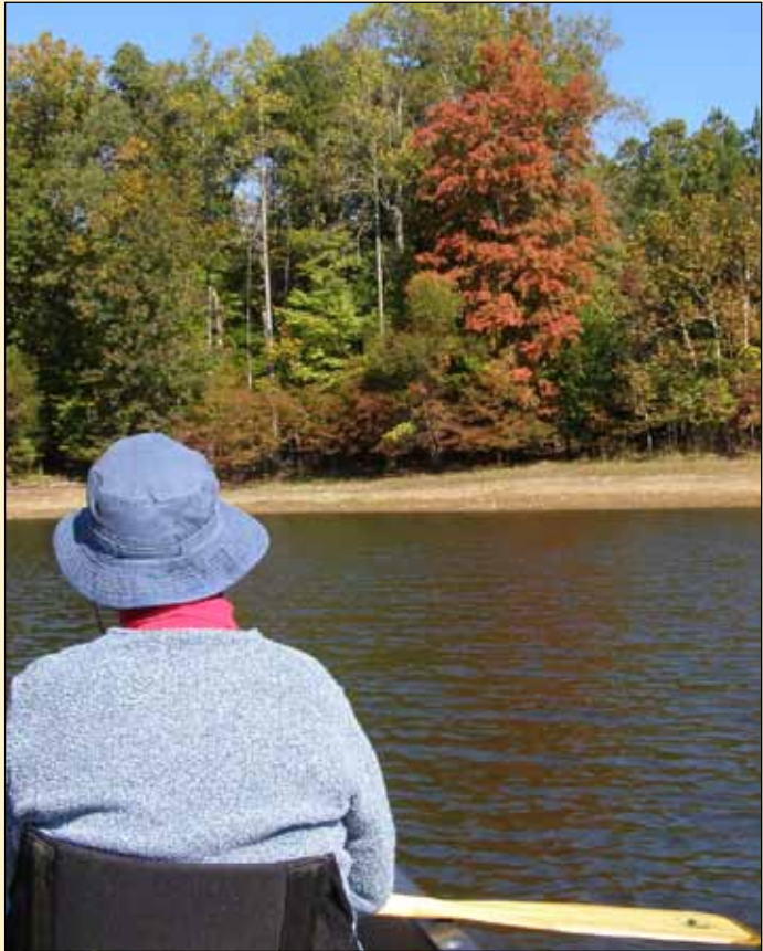
Paddlers have great views of fall color.

You may enjoy challenging yourself by trying to identify trees by their colors. Those bright yellows are most likely tulip poplars; golden yellows are probably hickories; burgundy reds are dogwoods or sourwoods; and brilliant, shiny reds,