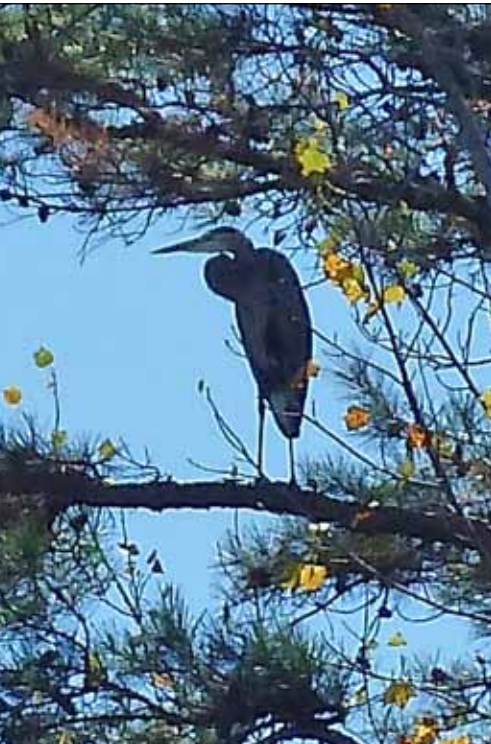
A great blue heron takes refuge in foliage of pine and tulip poplar on the edge of Cane Creek Reservoir.