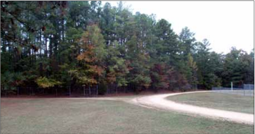
The potential library site at edge of the Carrboro Elementary's ballfields