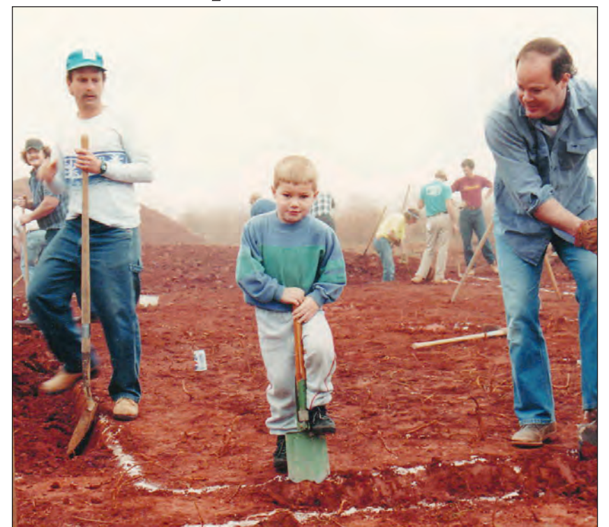
Volunteers dig the footings with shovels for the first Chatham Habitat house in 1989.