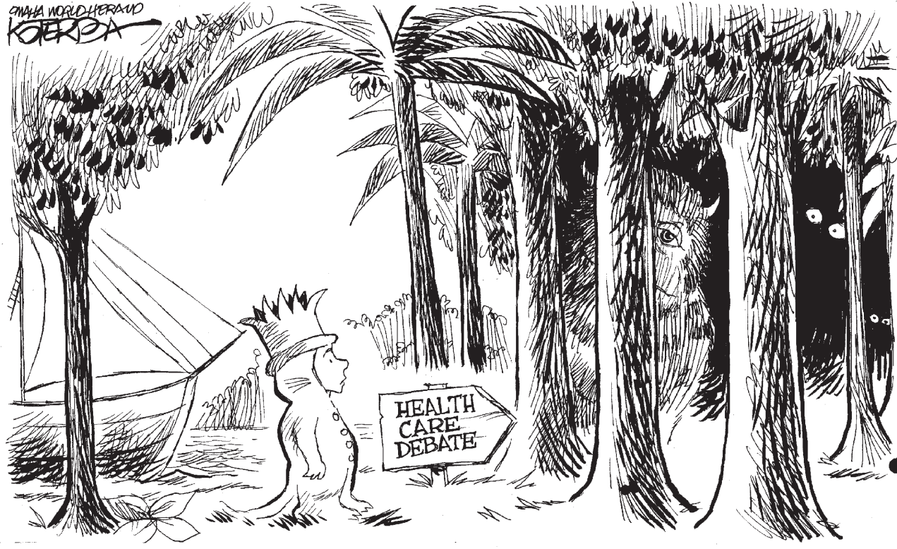
WHERE THE WILD THINGS ARE

We need better civic education here, there and everywhere in this country or we will continue to reap this bitter harvest of ignorance, cynicism and greed.