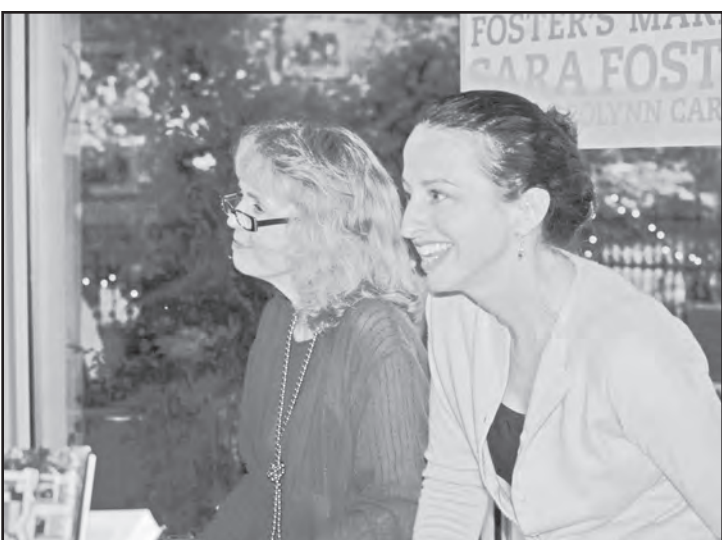
Authors Lee Smith and Haven Kimmel sign books at the Women's Center 'Tea with Lee' event last week.

After Kimmel climbed on the table with a witty remark about the last time she'd stood on a table in a public place, she explained that her purpose in following Smith had been to