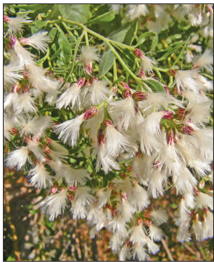
Showy seed heads of female Sea-myrtle

The Interstate 40 corridor is such a site. And since it opened, Sea-myrtle has taken advantage of it as a fast lane from the coast to the mountains. In our areas, it is so thick along roadsides and edges of abandoned fields that it is literally pushing out wildflowers and other natives like dogwoods, Cornus florida , and redbuds, Cercis canadensis . Within the last decade I have watched it move west along the interstate to the very entrance of Asheville. Air-borne seeds have only to land on disturbed ground for opportunities to grow. And these days our