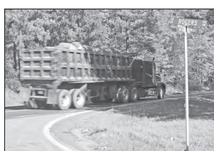
A truck headed to the landfill passes the intersection of Eubanks and Rogers roads. Community residents have been demanding the closure of the county landfill on Eubanks.

“Environmental Justice is the fair treatment and meaningful involvement of all people regardless of race, color, national origin, or income with respect to the development, implementa-