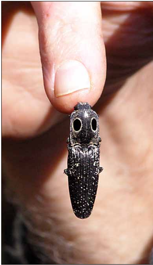
Eyed elater click beetle joins the group.