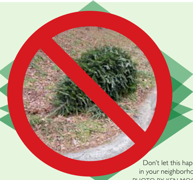
Don't let this happen in your neighborhood!

Staked upright near bird feeders, your tree provides multiple perches and excellent shelter. If not desired for a short-term evergreen effect in your winter garden, the branches can be cut and applied as mulch around trees and shrubs. Residents of the Ma-