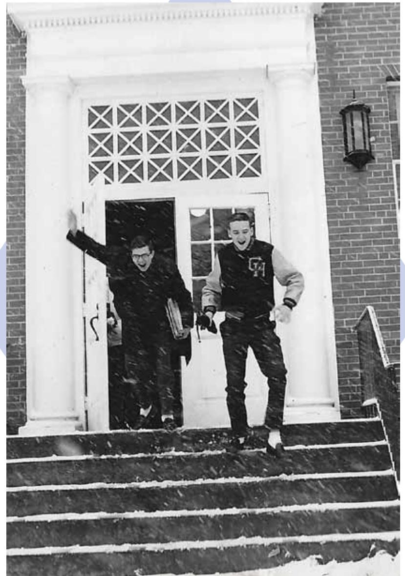
Snow Day 1963

Email Ken Moore at flora@carrborocitizen.com .