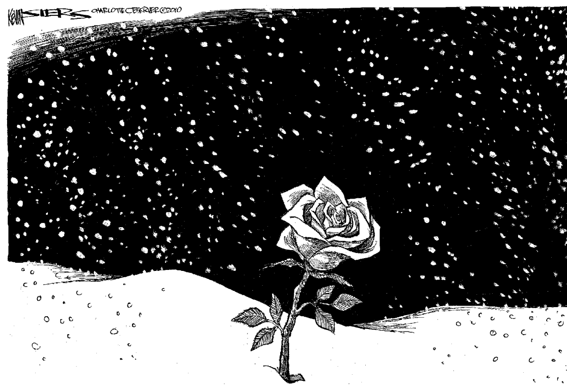
RESILIENCE: ELIZABETH EDWARDS, 1949-2010