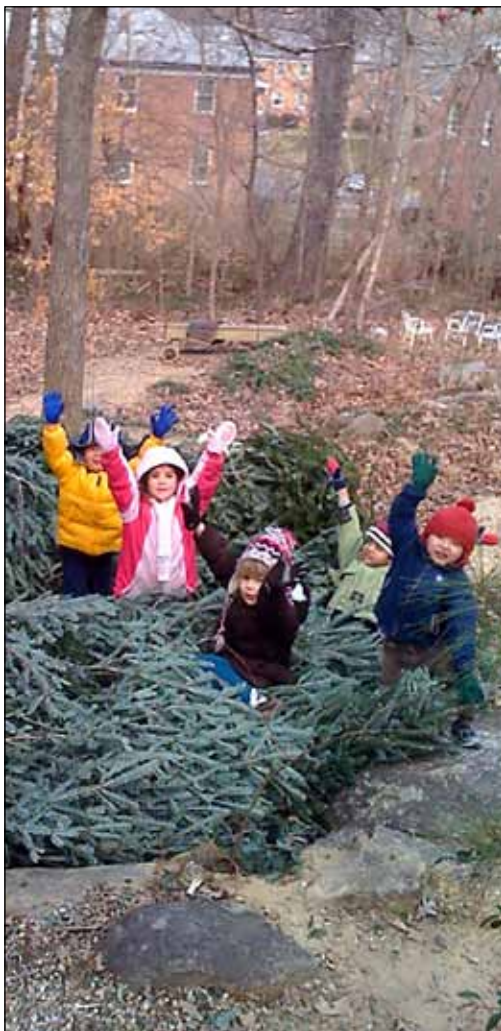
Willow Hill preschoolers celebrate their Fraser fir creation.