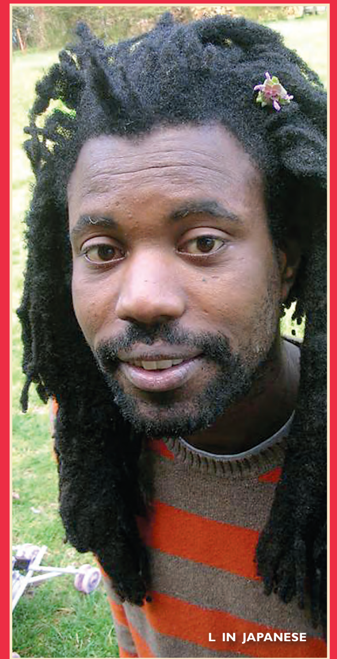
L IN JAPANESE