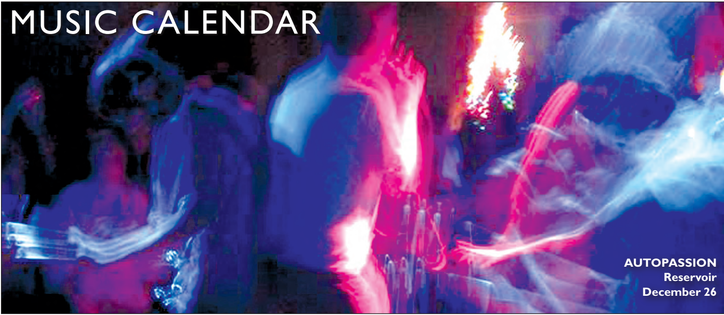
AUTOPASSION Reservoir December 26