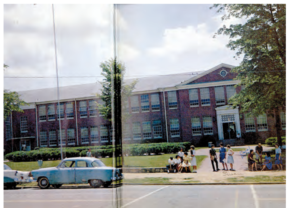
CHAPEL HILL HIGH SCHOOL, 1962

When you come upon a clump or two of Christmas ferns in the forest, you may assume that in that spot there is a little more moisture in the soil. Whenever I discover an extensive carpet of these ferns on a forest floor, I have an urge to simply settle down in the middle and enjoy floating on a sea of dark green. You may consider trying it sometime when no one is observing.