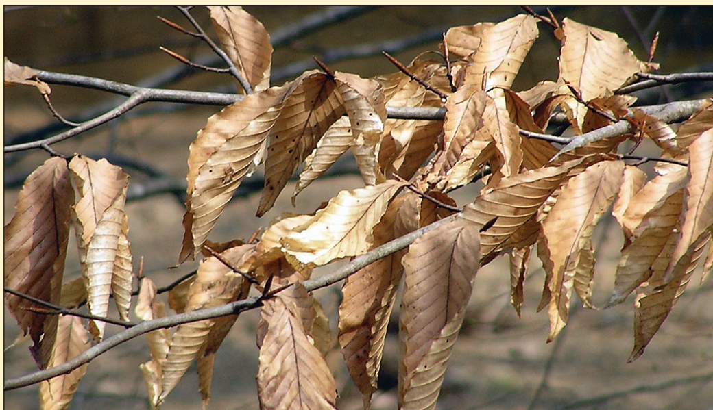
Copper-colored leaves and needle-like buds characterize American beech.

Do you have an important old photo that you value? Send your 300 dpi scan to jock@email.unc.edu and include the story behind the picture. Because every picture tells a story. And its worth? A thousand words.