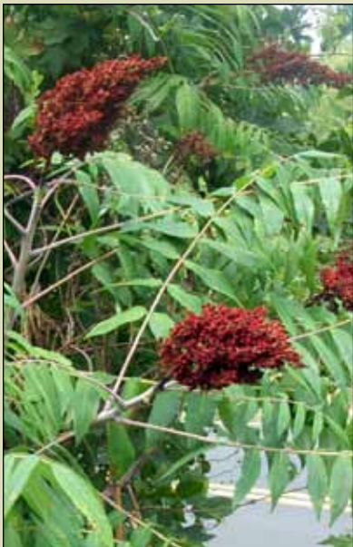
Smooth sumac cones