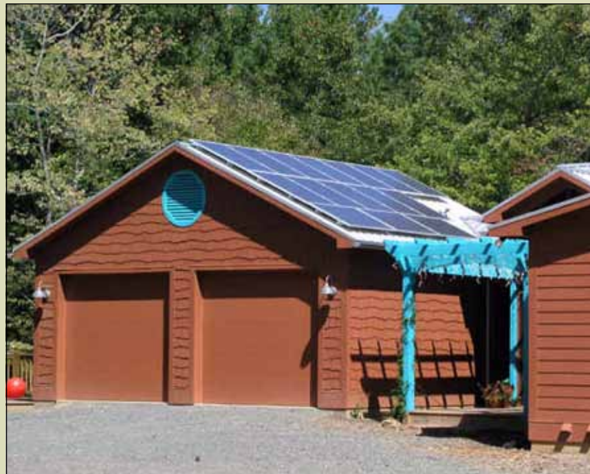
Solar installation on a recent Hartley Construction project