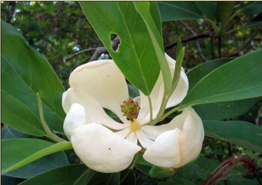
Sweet bay magnolia