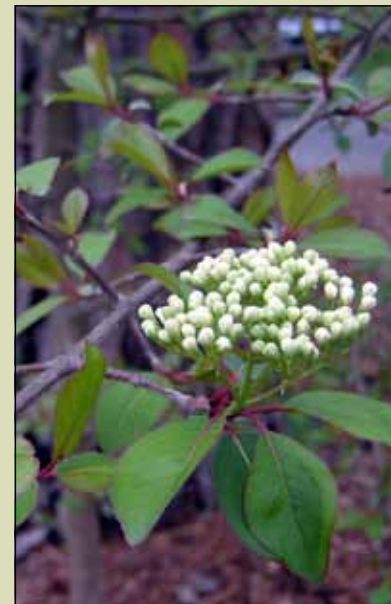
Blackhaw flower clusters

Deciduous holly , Ilex decidua , is my personal favorite plant! There are numerous cultivars, but I cherish every naturally occurring one. Lacking showy spring flowers, deciduous hollies go unnoticed until September, when the berries of the females redden against yellowing foliage. After leaf fall, there is no other plant to compare with the beauty of bare branches covered with brilliant red berries that persist until spring. It serves as a late-winter food source for numerous bird species, particularly cedar waxwings, robins, bluebirds, mocking birds and cardinals. Select two or three female hollies and one male to spread around your landscape, making certain to spot them where you can enjoy viewing them from indoors.