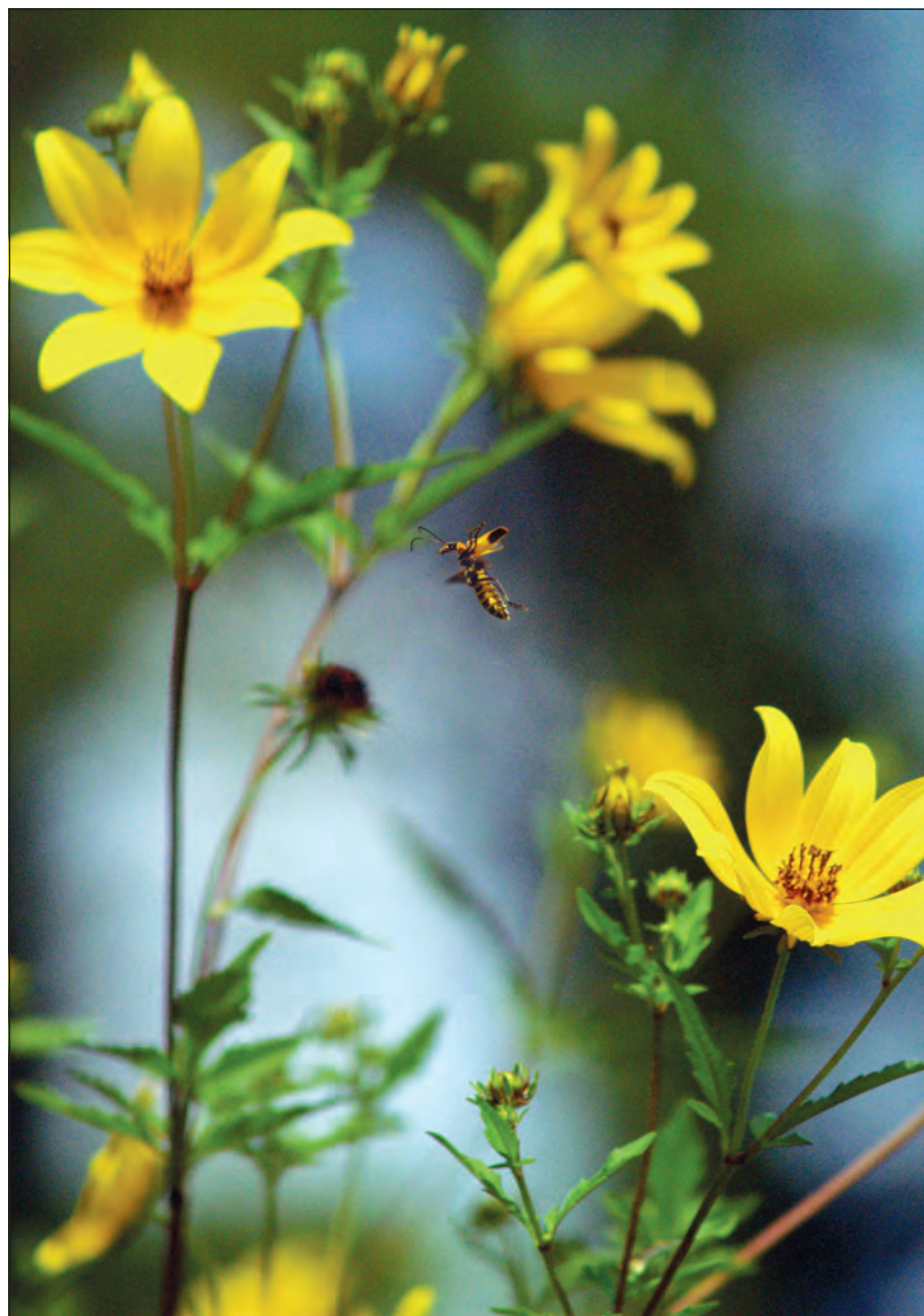
A soldier beetle flies among the bidens.

Prior to European settlement, fire from lightning strikes, Native American burning practices and buffalo grazing shaped much of the Piedmont landscape. Evidence for this view of the Piedmont comes from the maps and writings of early explorers (and modern interpretation by insightful botanists). French cartographer Guillaume DeLisle, in his 1718 map, labeled much of the North Carolina Piedmont as “Grande Savane,” outlining a vast expanse of open grazing land. Naturalist and surveyor-general of North Carolina John Lawson wrote in his 1709 A New Voyage to Carolina that, “In February and March the inhabitants have a custom of burning the woods ... an annual custom of the Indians in their huntings, of setting the woods on fire many miles in extent.”