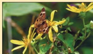
Buckeye Butterfly BY KIRK ROSS