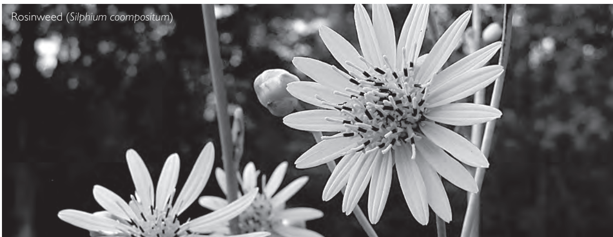
Rosinweed ( Silphium compositum )