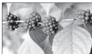
ON THE COVER American Beautyberry

The Carrboro Citizen Box 248 Carrboro, NC 27510 TELEPHONE: 919-942-2100