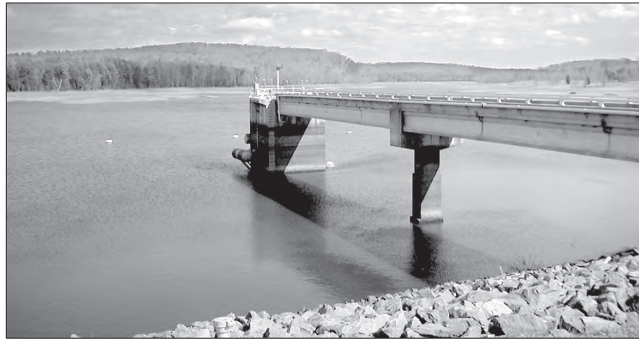
The Cane Creek Reservoir. As of March 6, our lakes were only 57% full as we move toward the hot, dry months of late spring and summer. Because of the lake bank's steep slope and concern about safe boating access, the Cane Creek Reservoir will not open for recreation on the normal schedule. However, our University Lake on the west side of Carrboro will open for recreation on Saturday, March 22nd

• OWASA drinking water shall not be used for any other outdoor purposes except emergency fire suppression or other activities necessary to maintain public health, safety, or welfare. The protection of public health, safety, and welfare may, under special circumstances, require the use of limited amounts of OWASA