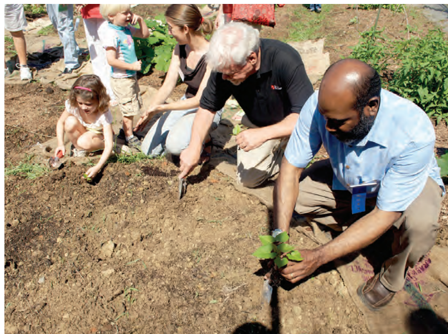
At the opening ceremony for the new James Street garden