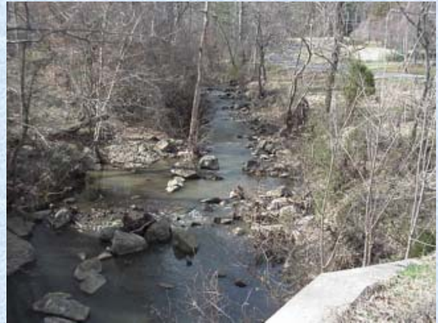
Near Village Dr.