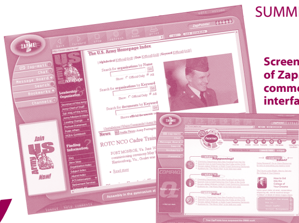
Screen shots of ZapMe's commercial interface.

O ur readers should be aware of a new trend in commercialism that may soon be reaching your school: advertising using new technologies. The most disturbing new scheme (and the first to go mass market) is ZapMe, the computer version of Channel One.