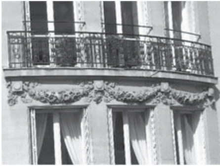
Apartment festooned with laurels

Paris is also full of showy buildings erected in imitation of Renaissance Italian villas to mark the linked power of money and aesthetics. The arcades and park of the Place de Vosges are designed in the Italian style, and reference early French yearnings to join the Renaissance, using ideal forms. Other squares also date from the 16th and 17th centuries, and embody the integrated architecture and a geometrical orderliness hoped to pacify and elevate the urban population. The point was to perfect civic life, using measurement and geometrical forms as means for embodying and conveying analytic intelligence.