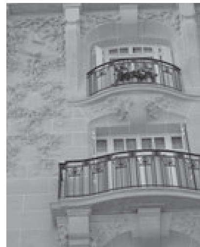
Apartment building with stone vines

As the commercial side of mesnagement thinking was re-appropriated for industrial purposes in Paris, yearning for nature returned in French architecture and design. Art Nouveau transformed metal and glass into flowers and vines that seemed to grow over buildings, into furniture, and around the metro.