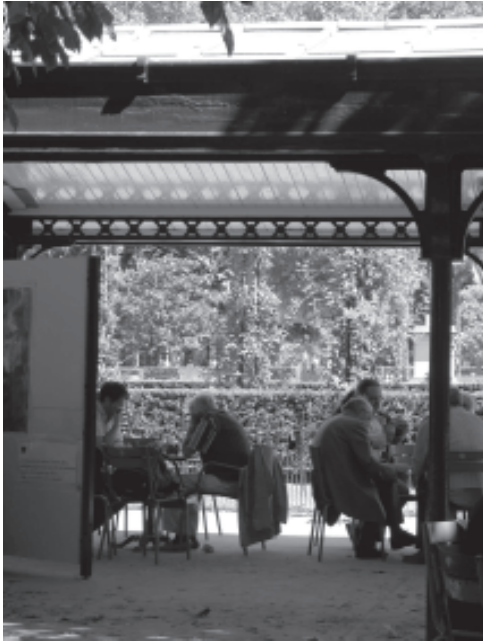
Chess players in the Luxembourg gardens, Paris.

Material cultural forms — physical entities like buildings, statues, streets, and parks — are necessarily carriers of memory. They show us where we (as human beings) have been, what we have done, how we have lived, and how we relate to the natural world. The learning psychologist, Don Norman, says some artifacts like an abacus, a desk, museums, books, and computers should be understood as “things that make us smart.” They are designed to give us memory of counting systems, sorting techniques, ways of organizing knowledge, means for defining beauty, and techniques of computational problem-solving. He argues that cultures pass on ways of doing work in the design of their tools and the content of their books. The fact that these practices are embedded in objects helps to recreate even complex social processes. If we are told to build our own house and given nothing to use for the job, we are in a very different position than if we are given a pile a lumber, some concrete blocks, metal frames, nails, hammers, saws, screws, screw-drivers, measures, T-squares, and levels. Each of the tools suggests problems for building the structure and ways to avoid them. (They also show the emphasis on measurement and geometrical forms in Western building traditions.) If we are not discouraged by the enormity of the task suggested by the array of tools, we can probably build a better house (certainly a more conventional one) by using the capacities built into these artifacts.