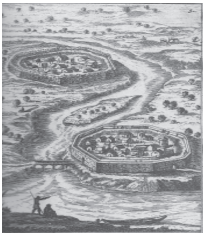
Circular town plans in northern France, Travaux de Mars

People often imagine that cities grew first as human settlements and sites of trade, adding parks and plazas to make them healthier and more livable. But the early cities of southern France, in their original form, were more like gardens than habitations, and more like warehouses than trading centers.