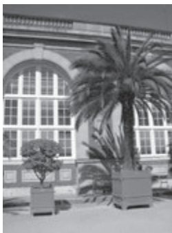
Orangerie in the Luxembourg gardens

A more surprising outgrowth of the mesnagement movement is the French passion for glass houses, which was derived (at least in part) from Serres' writings on the culture of exotic plants, the plant trade, and French techniques of intensive gardening for market purposes.