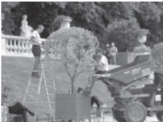
Gardeners with their tools in the Luxembourg gardens

Material cultural forms — physical entities like buildings, statues, streets, and parks — are necessarily carriers of memory. They show us where we (as human beings) have been, what we have done, how we have lived, and how we relate to the natural world. The learning psychologist, Don Norman, says some artifacts like an abacus, a desk, museums, books, and computers should be understood as “things that make us smart.” They are designed to give us memory of counting systems, sorting techniques, ways of organizing knowledge, means for defining beauty, and techniques of computational problem-solving. He argues that cultures pass on ways of doing work in the design of their tools and the content of their books. The fact that these practices are embedded in objects helps to recreate even complex social processes. If we are told to build our own house and given nothing to use for the job, we are in a very different position than if we are given a pile a lumber, some concrete blocks, metal frames, nails, hammers, saws, screws, screw-drivers, measures, T-squares, and levels. Each of the tools suggests problems for building the structure and ways to avoid them. (They also show the emphasis on measurement and geometrical forms in Western building traditions.) If we are not discouraged by the enormity of the task suggested by the array of tools, we can probably build a better house (certainly a more conventional one) by using the capacities built into these artifacts.