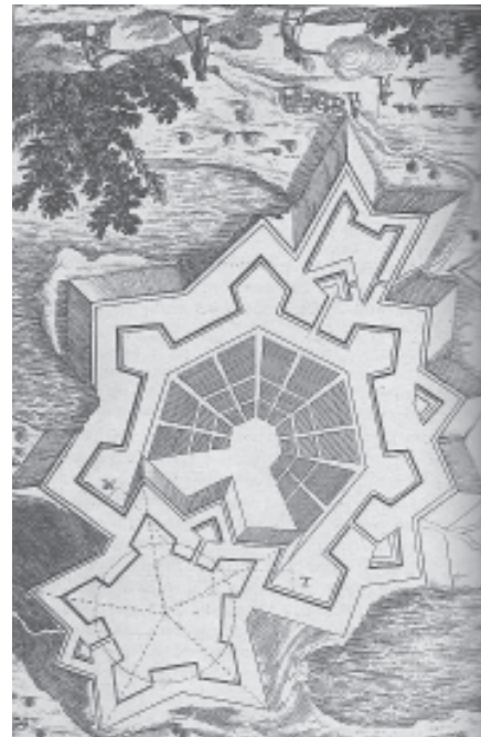
Fortress design, Travaux de Mars