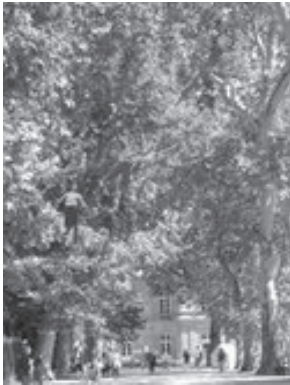
Flying children photograph exhibit in the Luxembourg gardens

Cities are designed as engines of political and economic ambition. But they are not just physical expressions of the triumphs of a Napoleon or Donald Trump. People do not simply