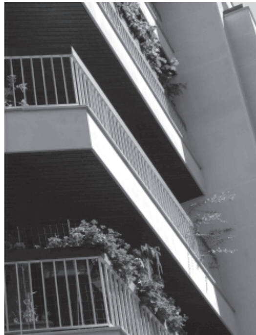
Modern apartment building with balconies

These utopian movements may not be familiar to us, but their heritage is part of architecture and city planning. Buildings are meant to carry ideals. People respond to these forms—even if they have no sense of their specific history. There is a sense of depth to the culture that imbues cities like Paris with a seemingly inexplicable vibrancy. Visitors often speak about the excitement of being in Paris. They see it in the streets, monuments, and museums — the built environment. They walk through old parts of the left bank, gawking or trying not to gawk at the buildings and gardens around them. They say the beauty is overwhelming but emotionally invigorating.