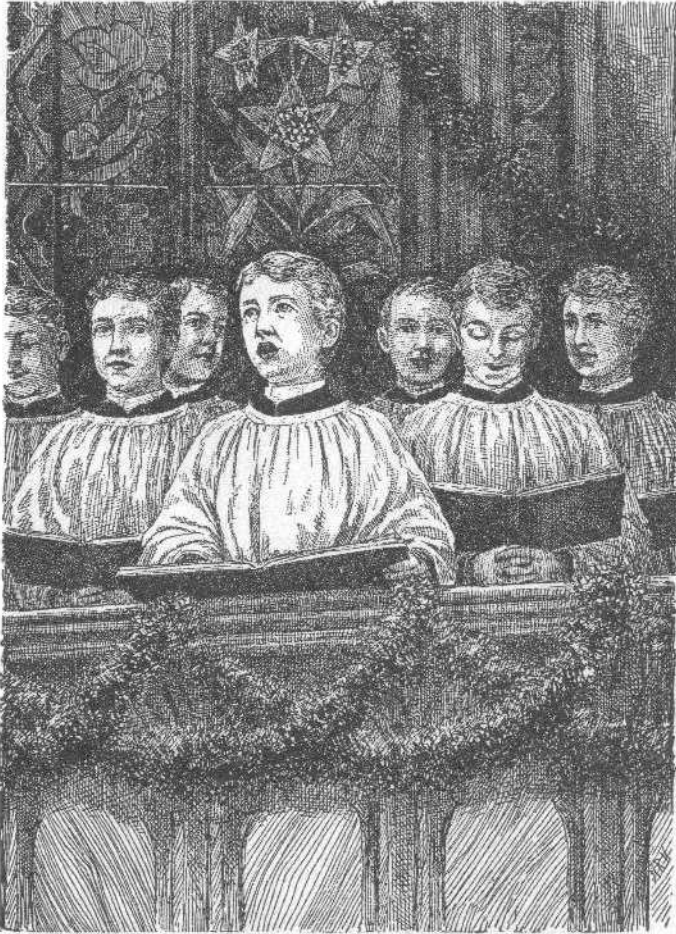
"MY AIN COUNTRIE"

“I hope she hears it,” said Mrs. Bird; “but they are very late to-night, and I dare not speak to her lest she should be asleep. It is almost ten o’clock.”