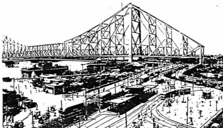
Chaos amidst splendour

A rag collector collects charcoal to express himself on the roads. Uneven roads with falls and humps in Calcutta do not distract anyone but when a young boy draws a mythological figure—then only people stumble at these road canvases. And their silent look at the artist has deeprooted depression within, going back to their